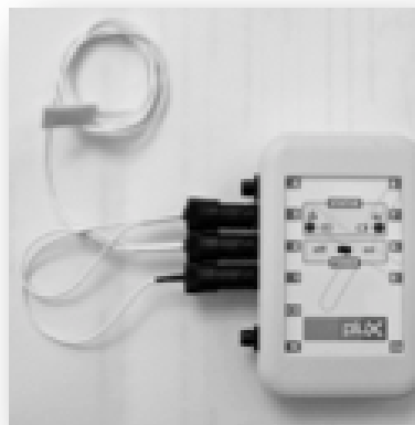
Figure 2. bioPLUX system used for body signal acquisition. Sensors are connected to the system and biosignals are sent to a computer via Bluetooth.

For body signal acquisition we used a commercially available system (bioPLUX™) with 4 analog channels. This system can collect biosignals from different types of sensors and sends these signals via Bluetooth® wireless transmission to a computer (base station). Its wireless transmission range of up to 100m is appropriate for the purpose of a user computer interface. This system was setup to use a sampling rate of 1000Hz and a 12-bit resolution per channel.