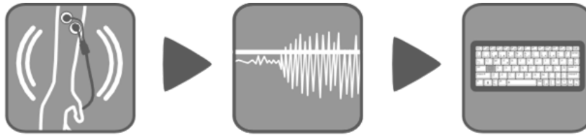
Figure 1. Block diagram of the proposed system: (1) Data acquisition - user activates the sensor; (2) Signal processing - captured signal is sent via Bluetooth to the computer and processed to generate control signals; (3) Switch-based control - when an event is detected, the system sends a command to an assistive communication software (e.g a virtual keyboard)