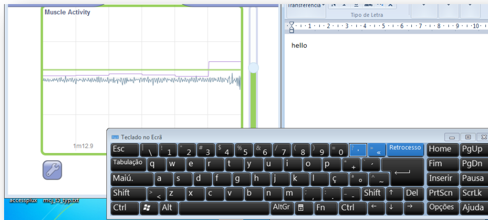
Figure 5. Example of the developed platform, controlling an onscreen keyboard to perform a writing task in a ©WordPad (from Microsoft) document. In this example, when detecting a control signal from EMG generated by the user, the key “Enter” is sent by the platform to the application of onscreen keyboard. This command performs a selection using the scanning method.

th (3) is also customizable, by manually changing the height of a threshold line on the screen (shown in Figure 4).