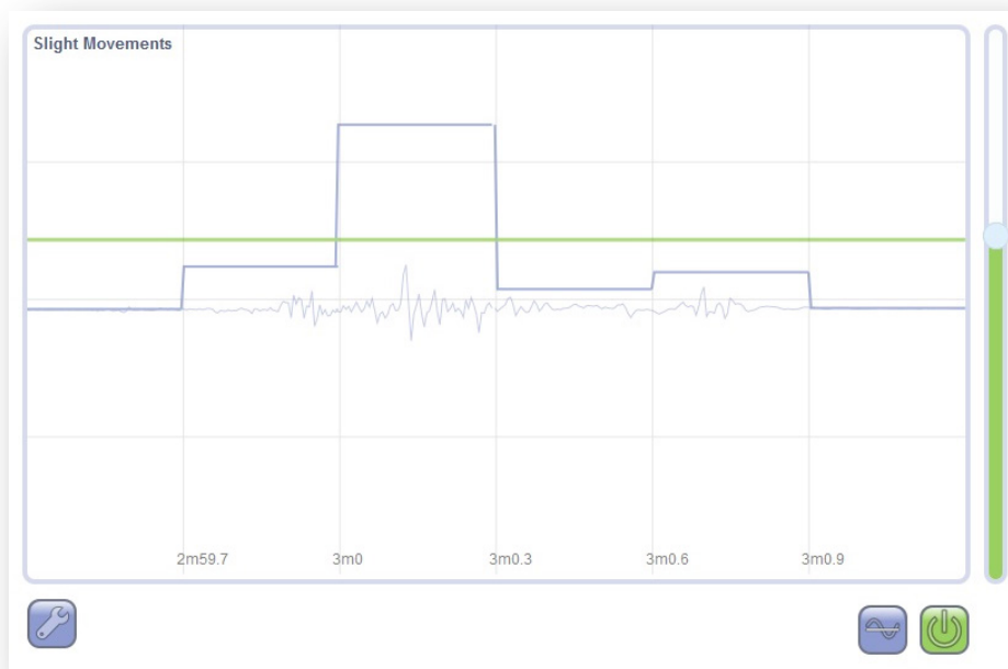
Figure 4. Visual biofeedback window developed for the presented study. Both body signal and control signal (from the variance algorithm) are visually presented to the user. User learns to control the body signal by watching it on the screen. Horizontal green line.

The developed software platform collects data streamed in real time by the bioPLUX system through the Bluetooth® port, and shows it in the computer screen. Users can then visualize both the body signal and the processed control signal in real time, and learn how to control them using biofeedback strategies (Figures 4 and 5).