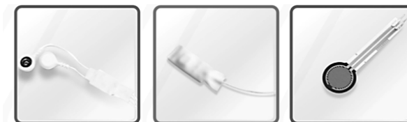
Figure 3. Set of sensors evaluated in our work; from left to right: electromyography sensor, accelerometry sensor, and pressure sensor.

In addition to wireless communication, we applied miniaturized sensors to provide comfort and flexibility. Our platform allows the application of different sensors, working as a customized solution for each user. We focused on three different body sensors, namely: a surface electromyography (sEMG) sensor (gain 1000, CMRR 110dB, 25-500Hz passing band filter, and input impedance >100M \Omega ), an accelerometer (ACC) (3-axial MEMS device with \pm 3G measurement range), and a force sensor (FSR) sensor (force sensitive resistor with 0-10Kg range and response time <5 \mu S). Figure 3 depicts the set of sensors evaluated in the proposed system.