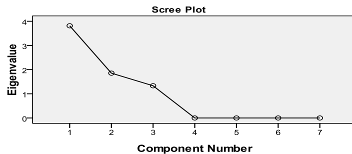
Figure 1. Scree Plot of investigation

We can conclude from the previous analysis and moderate test, the questionnaire data samples are suitable for factor analysis, then we use SPSS13.0 to make factor extraction to determine the number of factors. The number of Eigen value that greater than 1 is also the number of factors should be extracted. The result of the analysis is shown with gravel map, in Figure 1.