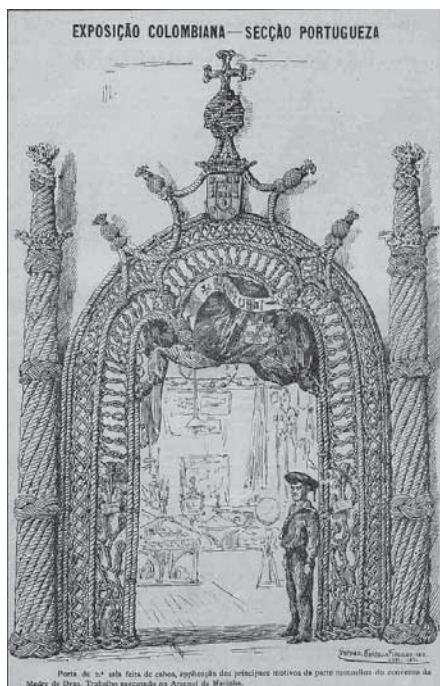
Fig. 5. Décor of the Portuguese section of the Ibero-American Exhibition of Madrid of 1892, by Rafael Bordalo Pinheiro

Pinheiro (1846-1905) at that exhibition 18 ; this had already been used by the architect José Maria Nepomuceno (1836-1895) for its reconstruction when the building was repaired between 1872 and 1874 19 .