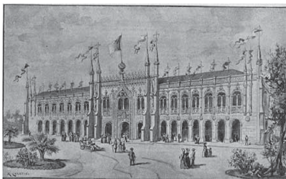
Fig 2. Pavillon of Portugal of the Rio de Janeiro National Exhibition of 1908 by Francisco Isidro Monteiro

Brazilian government and designed by the architect Francisco Isidro Monteiro and whose neo-Manueline style was reminiscent of the southern façade of the Jerónimos monastery 15 . Another example is that of the 1915 Panama-Pacific Exhibition, held in San Francisco, California, by the Portuguese architect António Couto (1874-1946) with the collaboration of sculptors Costa Mota Sobrinho and José Neto 16 .