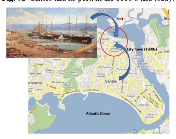
Fig. 01 -Santos and its port, in the 1880's and today.

The coffee expansion in the west of São Paulo, driven by improved conditions of production, and the growth reputation of coffee on a global scale, favoured exports, but also called for improvements in the transport system. The railroad that links the port of Santos to São Paulo and Jundiaí was authorized in 1856 and then was created the São Paulo Railway Company that, between 1860 and 1867, built a complex work with a system of inclined planes and numerous tunnels and flyovers, one of the most important railroads in Brazil, and provided a faster flow of goods and materials.