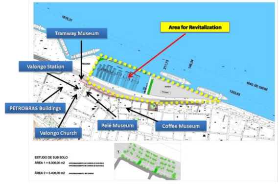
Fig. 04 - Forecast to establish the Program "Porto Valongo Santos."

Based in the analysis of the local specifics, in the guidelines of AIVP and in the international experiences, in 2010 GTP elaborated the Term of Reference, used for recruiting, under responsibility of the Town hall of Santos, studies of technical, economical, social and environmental viability for the Plan of Occupation presented by them, part of the Plan of Revitalization of the Port Areas and Integration with the Urban Areas in Valongo - Program Santos New Times , that obtained financing of the World Bank, and is near conclusion.