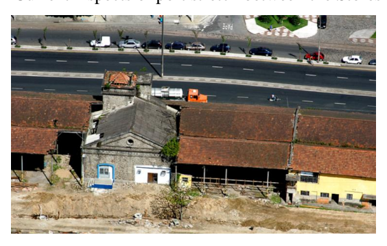
Fig. 02 – Current Aspects of port stretch between the Stores 1 and 8.

Despite the clear intention to solve the problem, there was a disagreement between the parties involved, because the Port of Santos belongs to a federal government area. This way, the destination of the port deactivated area, for purposes of urbanization, met legal challenges, in addition to uncertainties about assignments of powers for each of the parties in the process.