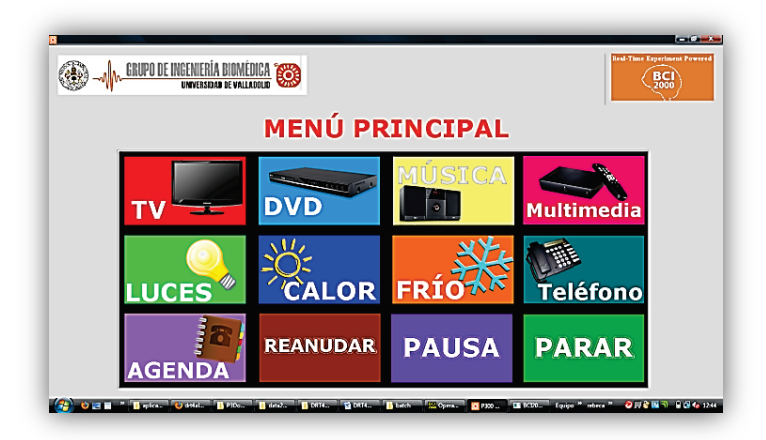
Figure 2. Main Menu of the domotic BCI application while running. In this frame the first row is highlighted.