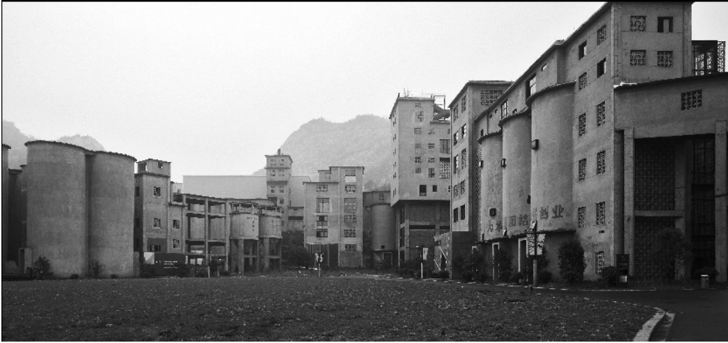
Hangzhou Zhijiang cultural and Creative Park

factory, instead to turn this piece of industrial sites into cultural and creative park. Although Zhuantang cultural Creative Park has not been established well, various ancillary facilities have not been built, but the join of China Academy of Art, still brings new changes and opportunities for the development of Zhuantang.