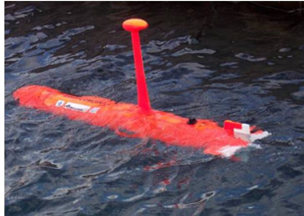
Figure 2. Experimental test at sea.

has about 2 hours navigation autonomy, 15 hours immersion/measuring autonomy, or a combination of them.