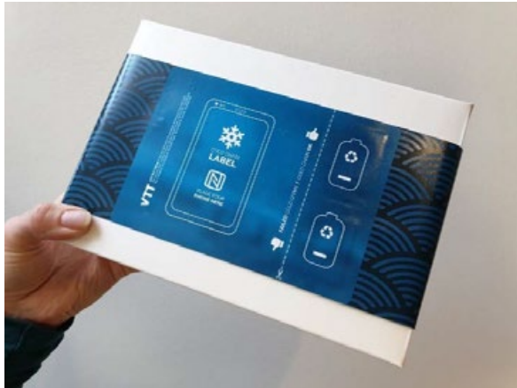
Figure 1. Rough design for temperature monitoring package.

Printed diodes and transistors can be integrated for implementing the supercapacitor (SC) loading and conversions circuits. This energy module, having the size of a credit card, is designed for indoor operation conditions to provide 2.3V supply voltage. This solution provides potentially environmentally friendly alternative to batteries.