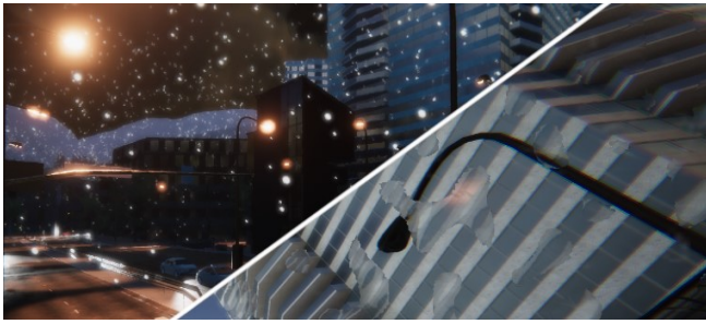
Fig. 2. Night-time snow and daytime rain effects.