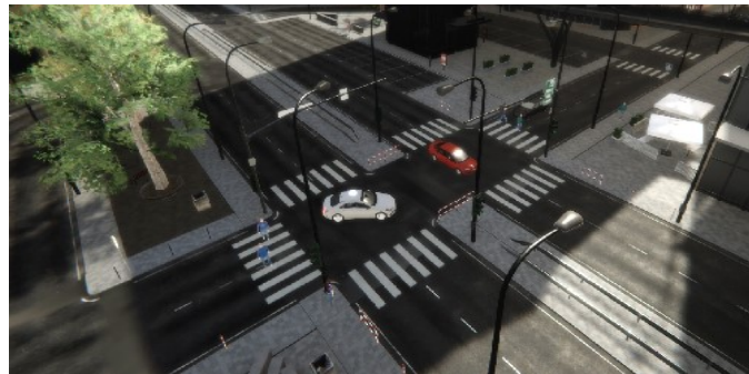
Fig. 1. Snapshot of the simulation environment.

The rest of this paper is organized as follows. Section II introduces the features of the CiThruS simulation environment. Section III compares these features with related work. Section IV presents the demonstration setup and visitor experience. Section V concludes the paper.