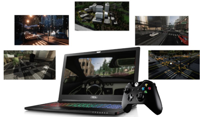
Fig. 4. Demonstration setup.