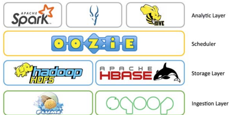
Figure 2. The Software Frameworks Stack

Thus, currently most of the raw data for the analysis needs to be ingested into HDFS first. HLoader is a tool for data ingestion from relational databases in a user friendly manner, with no deep computer science knowledge required, which is useful for instance for reliability engineers. Built around Apache Sqoop and Oozie, HLoader provides a REST API, which exposes metadata about available source and target storage systems to authorized users. The framework provides functionality to submit one-off or re-occurring Sqoop jobs using Oozie workflow or coordinator apps respectively. Apache Oozie supports event or data based conditions for triggering various actions (e.g. Spark, Hive and others). The project's source code can be found at https://github.com/cerndb/hloader . Figure 3 represents the architecture of the CERN HLoader framework.