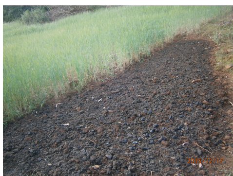
Figure 4: Practice of Animal manure as fertilizer in Dega Damot District (Photo by author, 2013)

Reducing open defecation is a challenge in the rural part of the country because of the livelihood and nature of the daily activity. As most of people are engaged in farming they do not stay in office or at home. From this perspective, it seems that it will take decades to get rid of open defecation for good although the efforts are significant. However, the good news is the tradition of the rural community in using of night soil as fertilizer by defecating in their own farm when they grow non-raw edible crops like maize, sorghum and the likes. Moreover, it is very easy to promote composting in the area since they have a trend of using animal manure as fertilizer very commonly as shown in Figure 4.