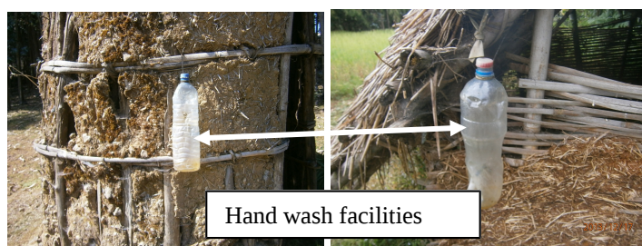
Figure 3: Common hand wash facilities

Most visited toilets have a plastic bottle for hand wash service. Yet, none of these systems are giving service in a proper way (see Figure 3). The bottles look deteriorated and never used for months, still they want to have them at the toilets. The reason observed from the field is that there is competition among villages for sanitation supervised by the extension health workers. Householders do not want to be embarrassed by missing of some requirements of sanitation. They often placed the bottles to satisfy the requirement of supervision by the HEWs. Surely, they are not benefiting from it. As to me, the HEWs should not focus on physical presence of sanitation facilities, but rather in behavioral changes in their evaluations.