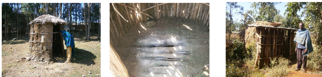
Figure 2: Typical pit latrines in Ethiopia

Over 90% of the surveyed households replied that they have a toilet. The most common type of toilet in the rural Ethiopia is pit latrine. It is made of an excavated pit, superstructure and a slab of local material. As shown in Figure 2, the cover of the toilet is either thatched or corrugated iron sheet depending on the economy of the household. Sometimes the wall could be covered with plotline sheet and no roof at all. To keep the toilet free from fly breeding and smell, ash is added after each use. All these are the efforts of the health extortion program. Discussion on the impact is quite challenging but seeing people on the transition towards sanitized environment is exiting. During data collection asking a direct question to an individual was thought to give an answer. If asked do you defecate open, the answer was no –with ashamed gesture. However, in practice night soil was observed here and there. It was interesting to see people getting ashamed of open defecation.