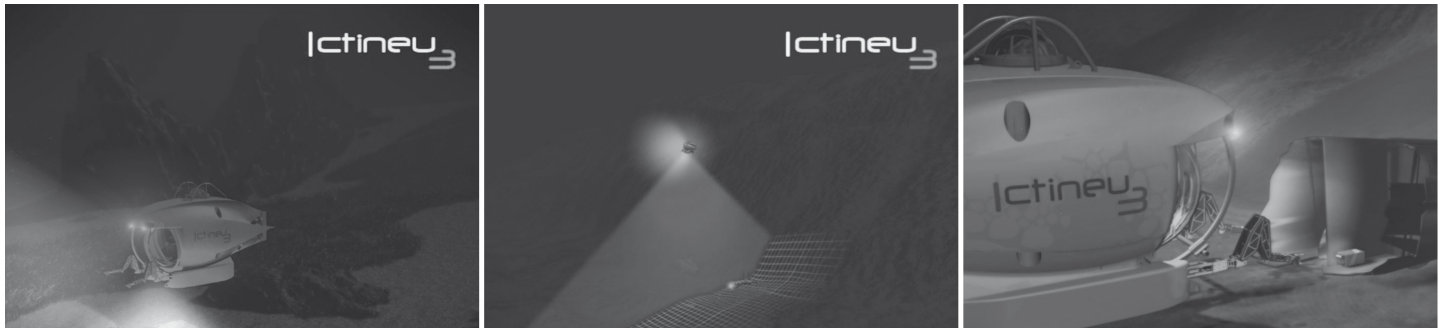
Fig. 1: Ictineu 3 possible missions, from left to right: archaeological photo-mosaic, fine scale bathymetric surveying, and black box recovery.

art signal processing and state estimation techniques. An acoustic link will allow for simple data exchange and voice communications between the submersible and the surface. Advanced control systems will be designed to enhance the sub capabilities and free the crew from cumbersome tasks. State of the art robust, fault tolerant, and nonlinear control techniques will be implemented to perform station keeping, path following, heading, depth, and altitude control.