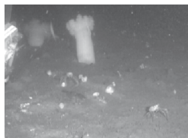
Fig. 2: A view of the scene in Saanich Inlet, BC, Canada