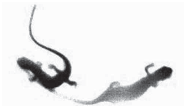
Figure 1. Thermal image of one couple of animals; the presumed male on the right, the female on the left.

Mean temperatures of presumed males were higher than females (Tab. I) for each body area considered.