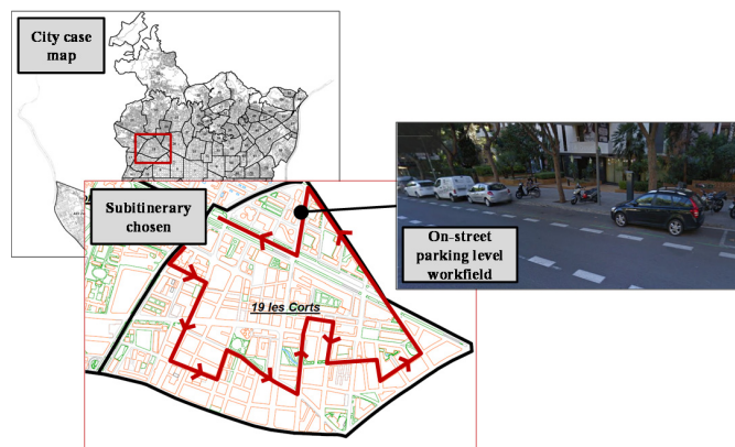
Fig. 1. Example of data obtaining referred to on-street illegal parking level

To record all data obtained, a pattern has been created to write down for each stretch the presence of an illegal parked vehicle with the typology of the violation and, also, some additional characteristics (bus lane, cycle lane, etc.)