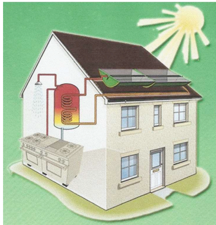
Figure 5. House with cylindrical parabolic collectors, storage tank, oven and shower [3]

A more complete installation is illustrated in figure 5. In this artistic representation, we can see two cylindrical parabolic collectors on the roof of a house that track the sun. Liquid heated at a high temperature is stored in an accumulator tank from which the oven can be directly powered. Another accumulator tank (not drawn) can feed several appliances at a low temperature by mixing with cold water for sanitary hot water purposes like showers. This installation can also feed a radiating floor.