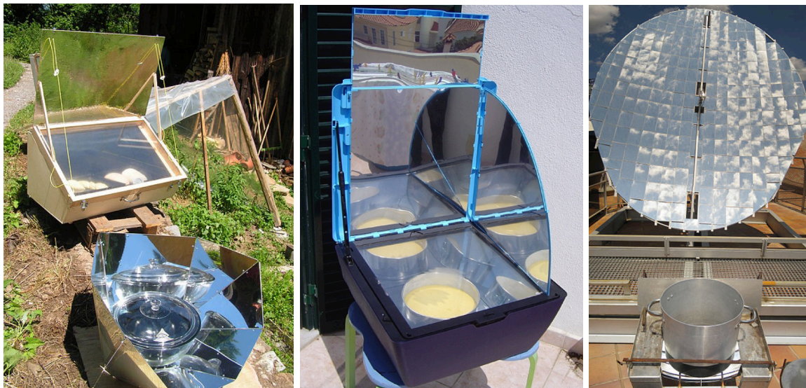
Figure 1. Solar oven model. Solar oven Portugal 2007. Parabolic solar Scheffler cooker [1]

Several types of solar ovens or cookers [1] that use solar radiation instead of fuel are currently available. One of the most common is a thermally insulated box fitted with a transparent glass or plastic top which absorbs direct solar radiation or mirrors or mirror coated material which reflects the light (figure 1). This device reaches sufficiently high temperature (up to 150-165°C) to cook by taking advantage of the greenhouse effect. It can cook almost the same foods as conventional ovens; however, the process can