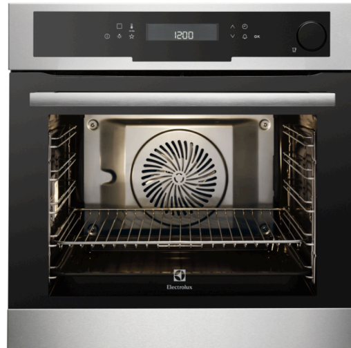
Figure 2. Indoor domestic oven with a fan [2]

A conventional domestic oven usually reaches 250°C with an electric power of about 2-3kW for food cooking. Compared with the solar oven, it is faster and more precise. Figure 2 shows the inside of a domestic oven, with a fan on the rear wall to homogenize the air temperature.