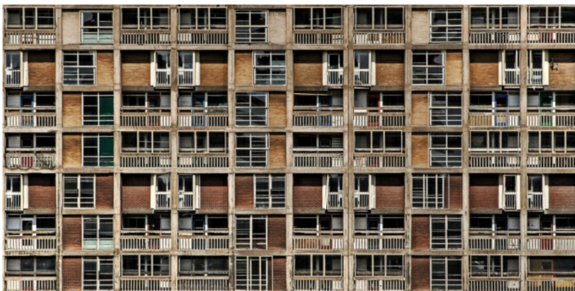
Image Credit: Park Hill, council housing estate in Sheffield, England