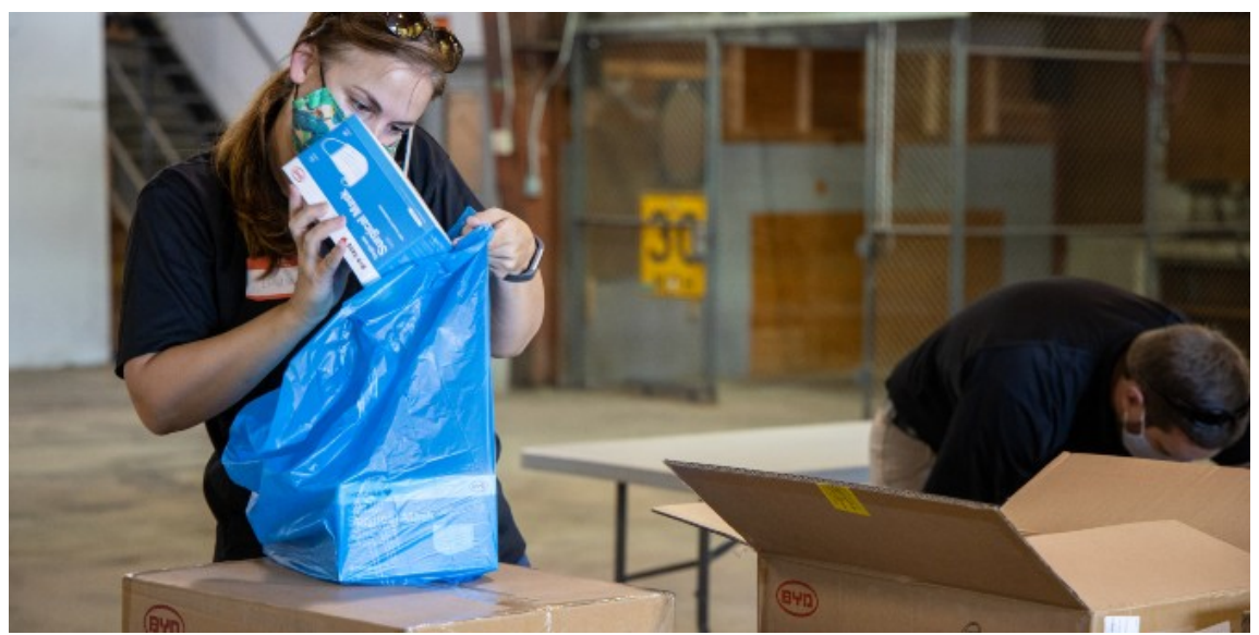
Packing PPE in Nevada, July 2020.

For alternative producers, the ability to respect standards is key. If users are not properly protected and are not aware of it, it may encourage the virus to spread. Consumer confidence is also important. Many of the initiatives to produce alternative (sometimes homemade) barrier masks came from standards agencies such as the AFNOR in France (whose website had more than a million hits), before other products could replace them.