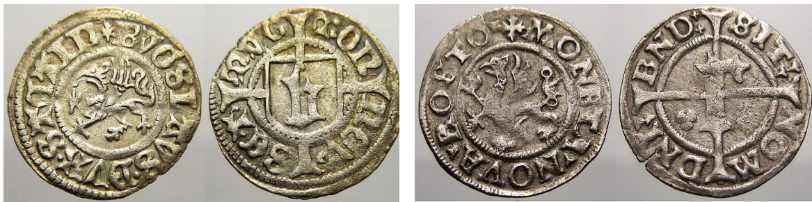
Plate 2: Pomeranian Schilling (left) versus Schilling of Rostock (right), first half of the 16 th century 26

Pomerania's coat of arms shows the griffin, which also happens to be the device of Rostock. Still, with some goodwill the town would have been able to design its Schillings in a way that made the difference between them and their Pomeranian counterparts obvious. The lettering on the coins