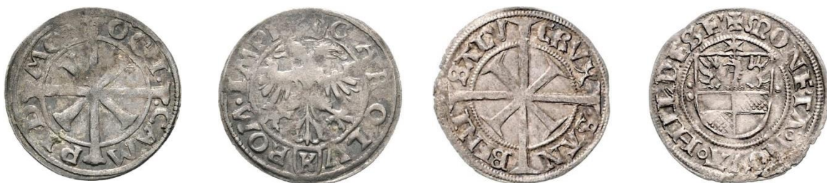
Plate 1: Genuine Kreuzer of the imperial city of Kempten in Upper Germany (left) versus imitation Kreuzer ('Small Schilling') from Hildesheim (right), c. 1535 to 1550 20

Today, the phenomenon Augsburg's city fathers feared is known as Gresham's Law. In its simplest and most widely quoted form the law says that 'bad money drives out good', and in this case it was the bad Kreuzers from Hildesheim that were expected to drive out the good Upper-German originals. By the sixteenth century, the phenomenon was widely known (and many authorities responsible for making monetary policy decisions were aware of it. 17 It is no surprise that the magistrate of Augsburg was afraid of its consequences. Still, the city fathers did not have to deal with an ordinary case of forgery. No criminal had misused the bishop of Hildesheim's coat of arms. In fact, the arms were not those of the bishop at all; they were those of the city of Hildesheim that seems to have enjoyed the right to issue its own coins since at least the thirteenth century. 18 Only a few years before, Hildesheim had concluded a contract with a new mint master that specified the range of coins he was to produce. Among them there was a fairly large coin, which the new master designed to look like the 2- Schilling pieces the monetary union formed by Lübeck, Hamburg, Lüneburg and Wismar issued, and a smaller coin called 'small Schilling ' that he modelled on the Upper-German Kreuzer . In both cases, his coins contained less pure silver than the originals. 19 There is no doubt that he intended to benefit from the sale his coins in places where genuine Kreuzers (and double- Schillings ) were current.