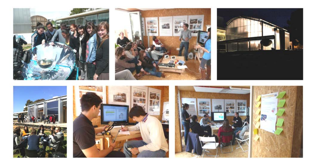
Figure 2: Living Lab LOW: Teaching, research and Innovation activities regarding sustainable architecture and lifestyle

Figure 2 shows the diverse activities linked to the Living Lab LOW3 project, from formal teaching and applied research activities, to social events, knowledge dissemination and less formal co-learning activities.