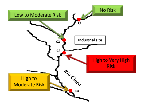
Figure 2: Results of the risk BFRs at the Cinca River

A total number of 38 experts have contributed to this study. Experts' opinions have been used to define the ranges associated to the fuzzy sets describing the different factors of the system. Concerning the variables' weight, one output from the experts is that toxicity is more important than persistence and, at the same time, the latter is more important than accumulation. As a particular example of the results obtained, the risk assessment for the Cinca River in Spain is presented in Fig 2. As it can be seen, the risk increases after the industrial site, being the effects of pollution still persisten more than 30km downstream.