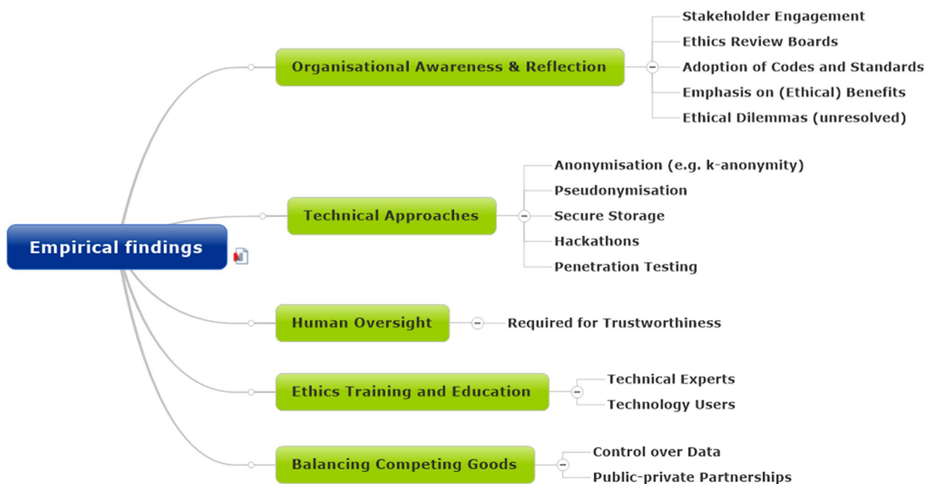
Fig. 3 Mitigation strategies employed in case studies

about data collection, data manipulation, and computational aspects of AI applications (CS10). Software designers must incorporate the necessary reliability aspects and consequently redesign the software to ensure their inclusion (CS01). However, people with such skill sets are rarely trained in ethical analysis. This was especially apparent in CS01, CS08 and CS09, where all of the interviewees were technology experts and had no background in the study of ethics but were acutely aware of privacy concerns in AI use.