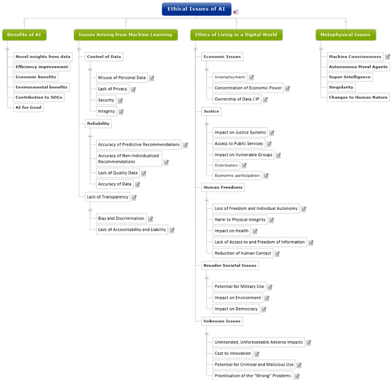
Fig. 1 Ethical issues of AI

as well as supporting areas of the economy other than just the AI sector (European Commission 2020). Such efficiency gains can have immediate effects by reducing environmental damage arising from inefficient production.