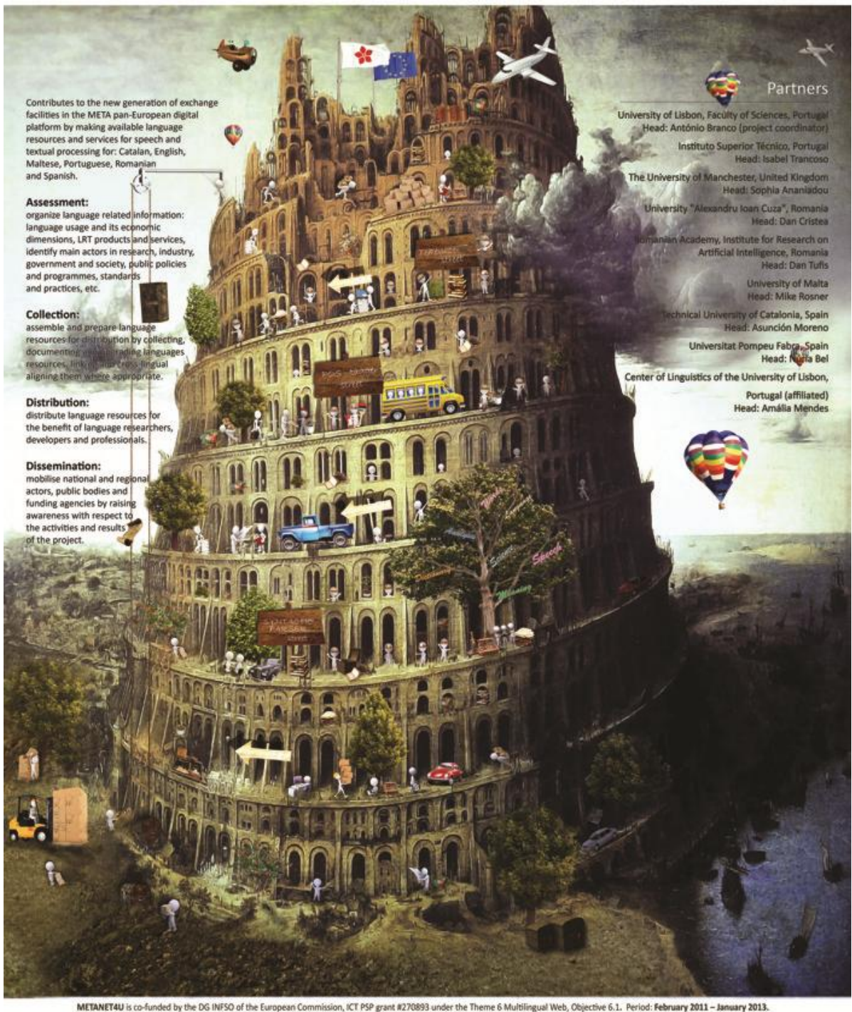
a meta-net project co-funded by the European Union