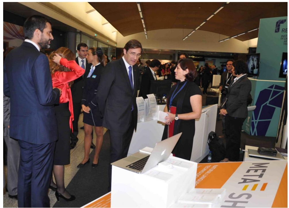
Figure 6 The Prime Minister of Portugal, Pedro Passos Coelho, showing interest in the META-NET and META-SHARE platform