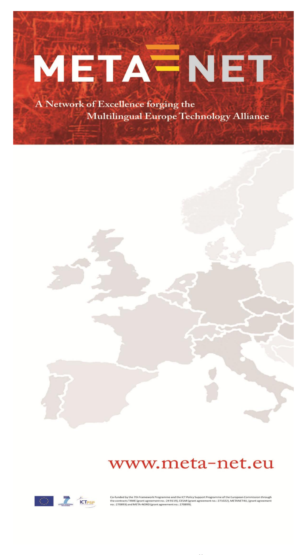
Figure 2. METANET4U roll-up