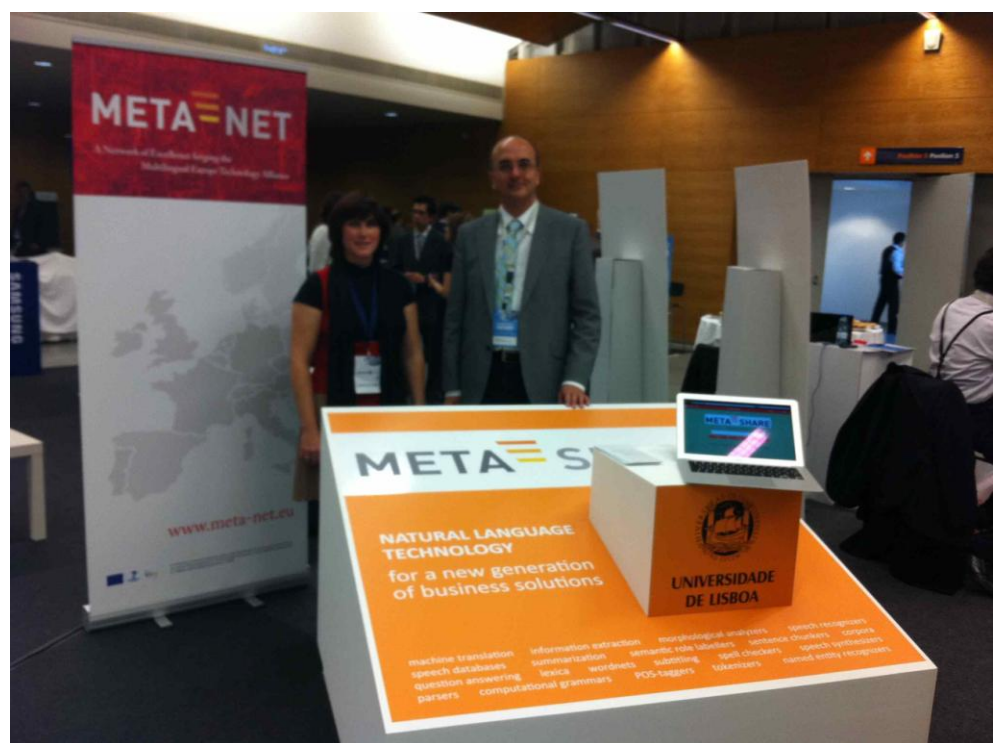
Figure 5 Participation at the 21st Communications Congress, the largest ICT trade fair in Portugal

FCUL participated in the 21st Communications Congress, organized by APDC- Portuguese Association for the Development of Communications in Lisbon between the 23-24 of November 2011, with an exhibition stand presenting META-SHARE and META-NET (Figure 5). The APDC Congress is the largest ICT trade fair targeting the industry sector in Portugal. The META-NET stand was in the exhibition room Innovation Lounge, an exhibition area dedicated to innovative products and services and to networking with and among ICT and New Media companies. The Prime Minister of Portugal, Pedro Passos Coelho, visited the META-NET booth and got interested about language technology, META-NET and META-SHARE (Figure 6).