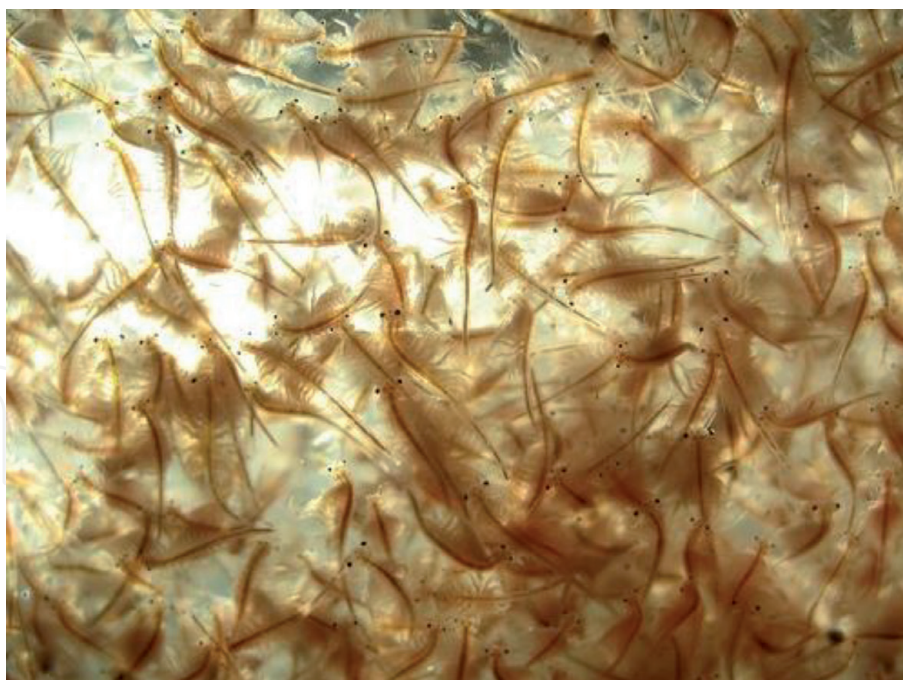
Figure 1. 125 ml live baby brine shrimp coral fish [14].