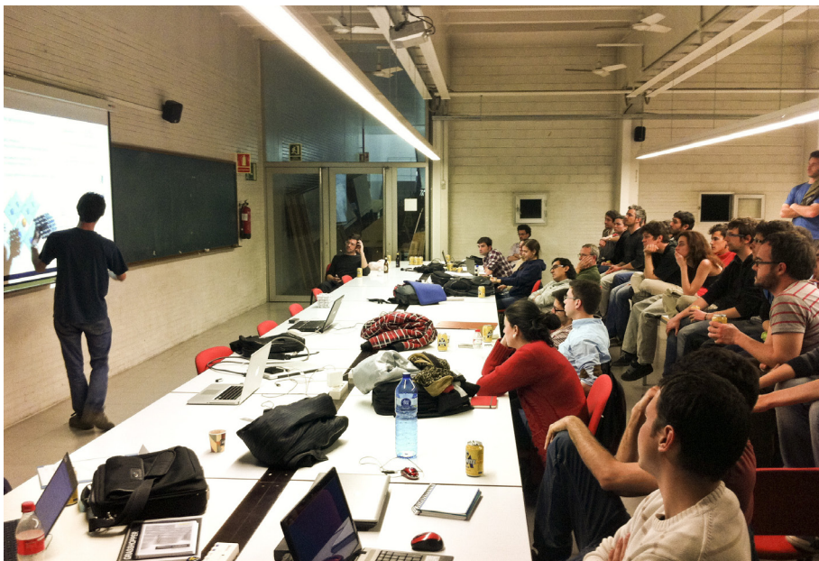
Fig. 2 FTH03: the ultimate Perovskite project