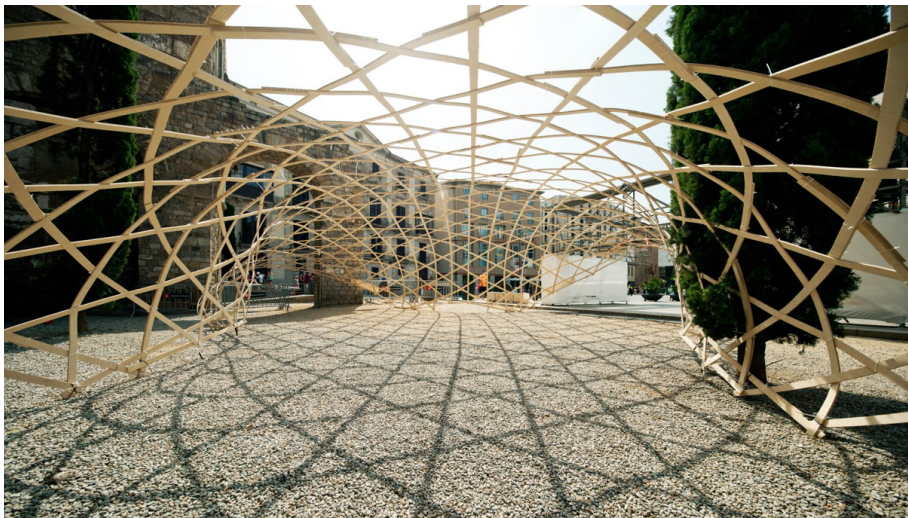
Fig. 4 Jukbuin Pavillion.

The research proposes a combined strategy of building a lightweight gridshell with a low-tech fabrication process based in vernacular weaving techniques and using strictly industrialized boards. The goal is to minimize energy and material waste, in the manufacturing process of an efficient structure while simplifying assembling process.