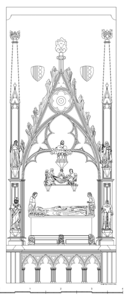
Figure 5. Linedraw obtained in the cloister.

In order to graphically reconstruct the monument it was essential to determine those elements that, due to their small size with respect to the rest of the monument, were not sufficiently detailed by the general scan. In these cases the detail model was used.