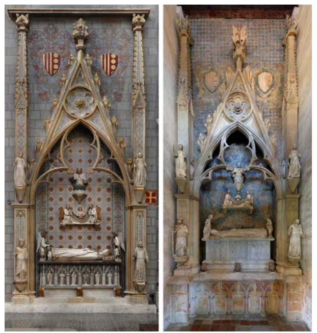
Figure 1. The both faces of the monument. Left, the interior of the church. Right, the cloister part.

the representation of the deceased lying body, which in the church can be accessed by the whole congregation, while in the cloister it can only be approached by the nuns. This particular disposition depicts the queen's life, who retired from public life in the Clares' Monastery that she founded.