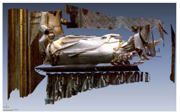
Figure 4. Laser scanning detail.

As well, the orthophotographs have been obtained.