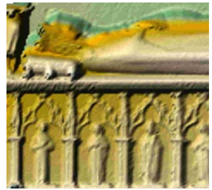
Figure 3. DSM by digital photogrammetry.

The surface model, figure 3, was employed to establish the comparative analyses between the two survey methodologies: digital photogrammetry and laser scan. It has a precision of 3mm in depth.