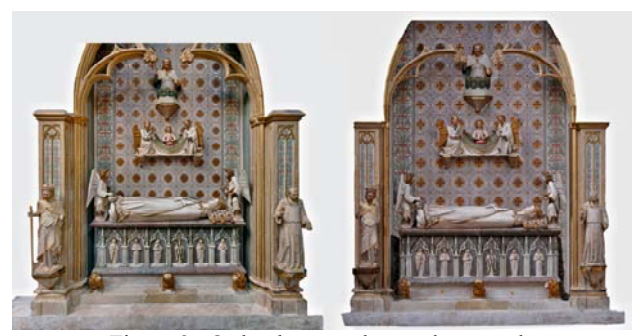
Figure 2. Orthophotography vs photograph.

These are not complete in some areas due to occlusions and bad model, so they have been completed with partial rectifications.