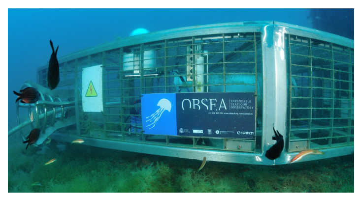
Figure 1 OBSEA Structure

In most cases, actual observatories are using a proprietary Data Management and Instrument control framework. We can di-