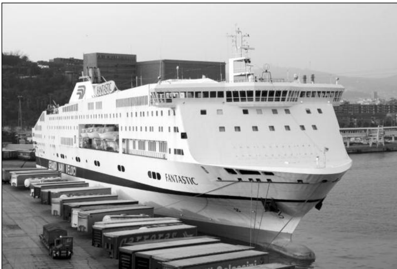
Figure 1. Fantastic Ro/Pax ship berthed at Barcelona port

Maritime transport emissions are mainly regulated by the MARPOL Convention and some specific European regulations. The new regulations regarding SO 2 and NO x maximum emission levels aim to reduce this kind of pollutant components, which will be the weak point of maritime transport in the future. Of all modes of transport, the maritime one is responsible for the largest amount of SO 2 emissions into the atmosphere, which is only compensated by the use of low sulphur fuels or exhaust gas cleaning systems. However, sulphur emissions from maritime transport only account for 6% to 12% of total anthropogenic emissions (Chengfeng 2007).