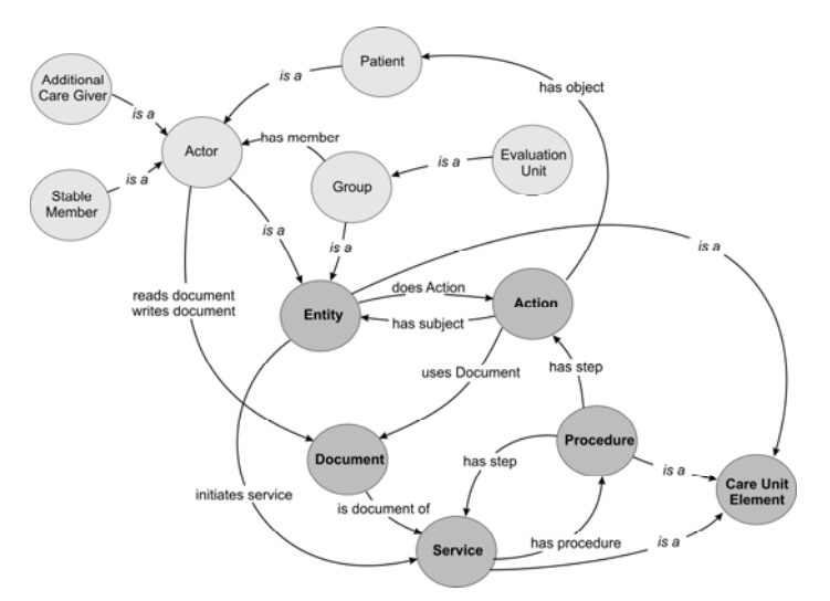
Figure 1. General structure of the Actor Profile Ontology.

The Actor Profile Ontology (APO) stores the organizational knowledge of the K4Care HomeCare model. It states the common and basic HC structures shared by the main sanitary systems in Europe as the minimum elements needed to provide a basic HC assistance, according to the HC model proposed in the K4Care project [5].