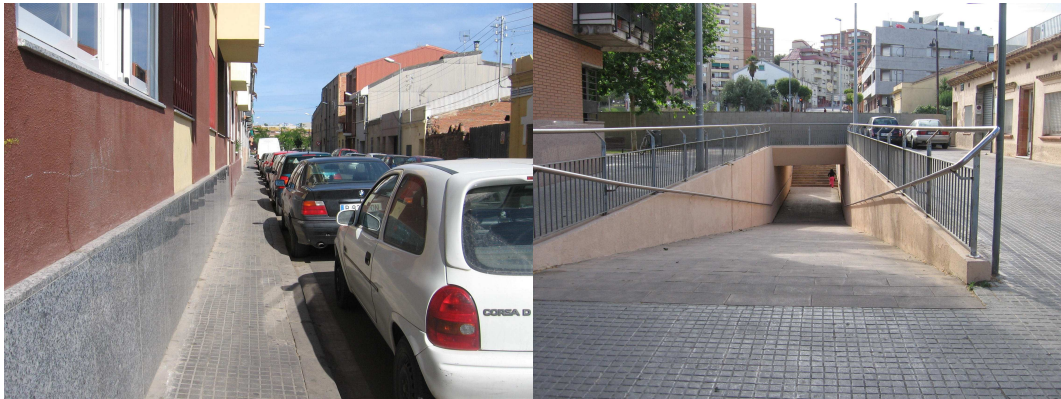
Figure 3: unsafe public spaces, El Congost.

During a second meeting, the neighbourhood's office proposed solutions for the requests made at the first meeting. The proposals involved general improvements of public spaces regarding women's demands of good lighting and visibility; civic education campaigns to improve relations within the neighbourhood; improvements in the public transport system and remodeling of the tunnel under the railway lines. As regards facilities, proposals include remodelling the sports hall; putting up basketball hooks in squares; opening school playgrounds beyond school hours as public spaces; a municipal nursery.