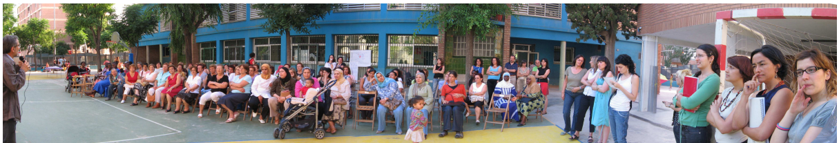
Figure 2: Workshop 1 st session in El Congost. The Major assumes the necessities expressed by women as a must for the urban project.

The first contributions regarding women's needs in relation to their urban experiences can be drawn from the social work carried out by intercultural discussion groups, on the one hand, which created the Intercultural Commission of Women of Congost, and a first experience known as "Banco de tiempo", on the other.