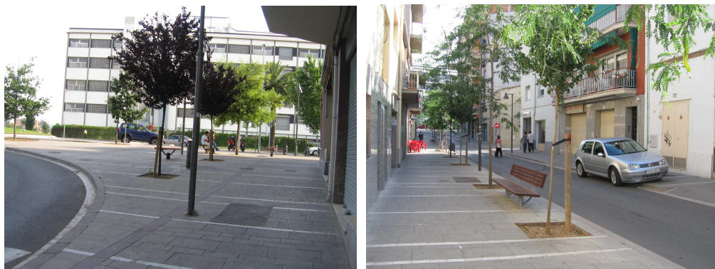
Figure 4: redesigned sidewalks attending women's needs.

At present, the process continues to be conducted with the transversal work group. People living in the neighbourhood are invited to receive information on the project and share their views on every work that is completed, and meetings are held with the intercultural commission of women of the Congost so that efforts are coordinated for improving the neighbourhood.