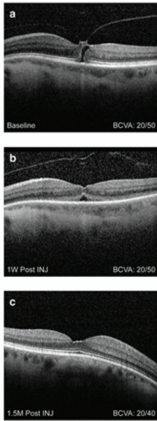
Figure 1. Case 1. Spectral domain optical coherence tomography of a 71-year-old female with VMA and a tractional macular hole in the left eye. (A) Baseline visit. No presence of ERM; BCVA 20/60. (B) One week post ocriplasmin injection. VMA resolved and macular hole closed, but increased presence of SRF; BCVA 20/50. (C) Seven weeks post treatment. Macular hole remains closed, no evidence of SRF; BCVA 20/40. BCVA, best-corrected visual acuity; ERM, epiretinal membrane; INJ, injection; M, month; SRF, subretinal fluid; W, week

FTMH with VMA, with no ERM or presence of SRF (Figure 2A). The size of the tractional macular hole size at baseline was 145 \mu\text{m} , minimum linear diameter (MLD). The patient opted for ocriplasmin treatment and received the intravitreal injection 14 days after the initial visit. Pre-injection visual acuity was 20/150.