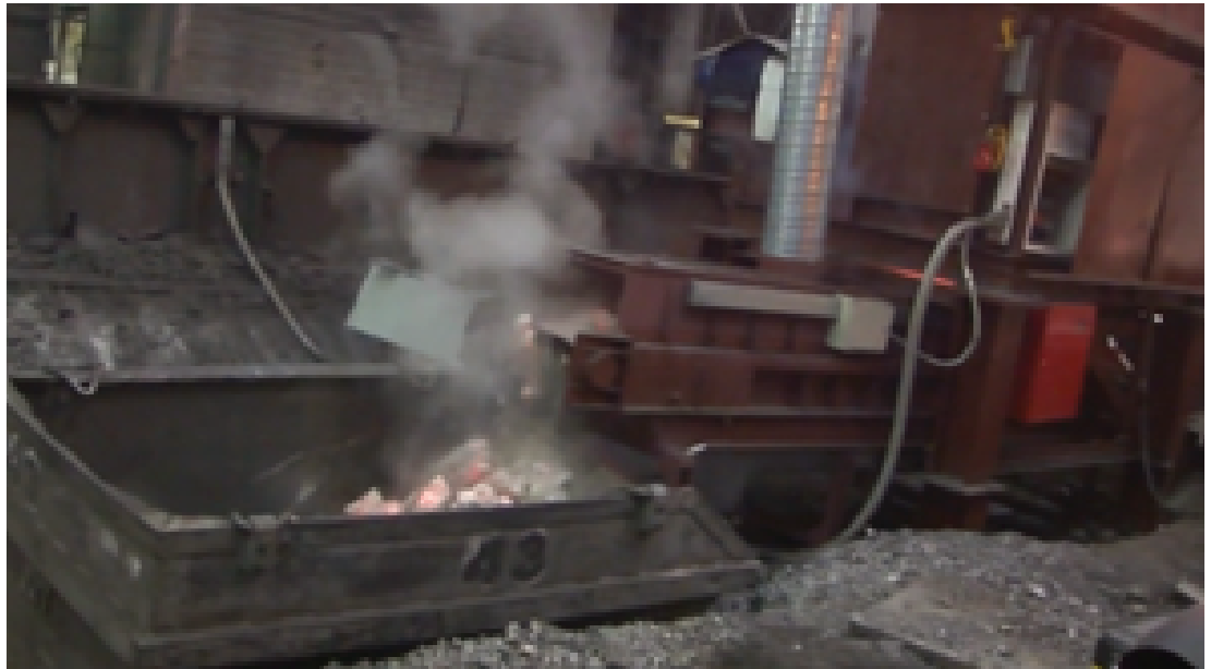
Figure 5: Discharging of cooled slag from the installation into the receiving reservoir.