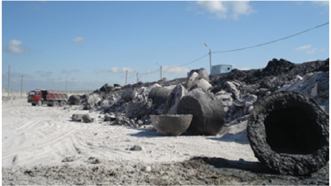
Figure 2: A view of disintegrating slag upon crystal-chemical stabilization.

lumpy non-dusty sparsely soluble material is acquired – but in process of stabilization its mineral composition is modified as well (Figure 2).