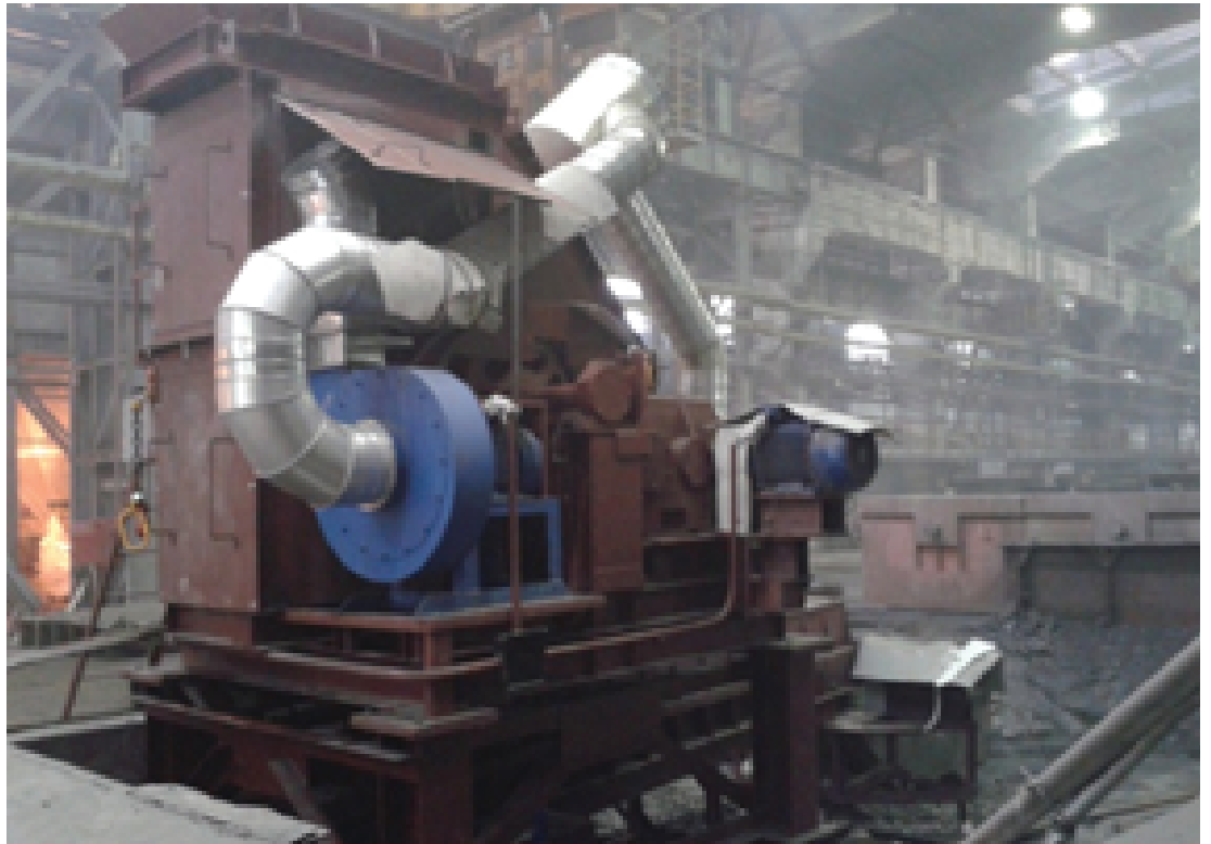
Figure 3: Allocation of the rotor-type installation in the receiving trench for slag of West-Siberian Electro-Metallurgical Plant.