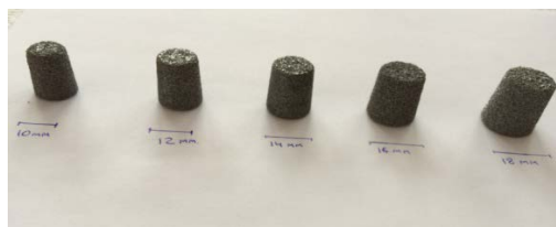
Fig. 1. Set of subtalar porous TiNi-based implants

In the R&D Institute of Medical Materials and Smart Implants conic porous composite TiNi-based implants in experimental diameter from 10 mm to 18 mm (Fig. 1).