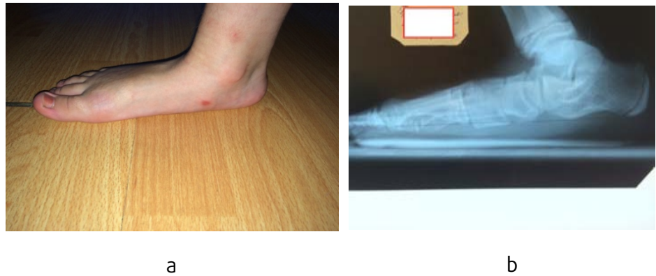
Fig. 2. General appearance of foot (a) and patient X-ray examination (b) before treatment

The operation is performed under spinal anesthesia. Patient-supine position. Pneumatic tourniquet is applied on middle third hip area. Preliminarily wrapping the operating lower limb with elastic bandage, then pumping pneumatic tourniquet, so as to minimize the blood loss. The lower limb is antiseptically treated three times. First, 4 cm oblique skin incision slightly anterior and distally to lateral malleolus; layer-to-layer exposure to subtalar joint; with Luer forceps strip scar tissue and ligament-filled subtalar joint from out of sinus.