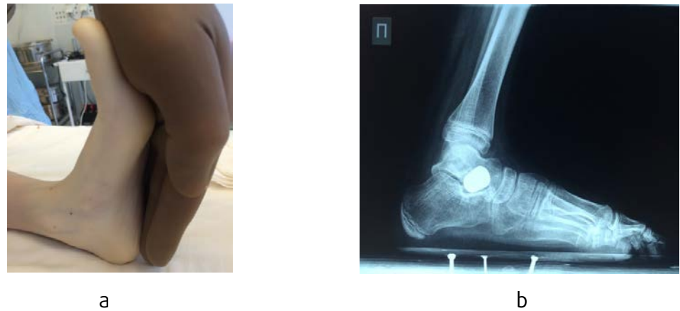
Fig. 4 General appearance of foot after operation (a), X-ray examination with implant (b)

Test trials of foot movement is performed to check if the implant is firmly fixed in the joint and excluding migration (Fig. 4).