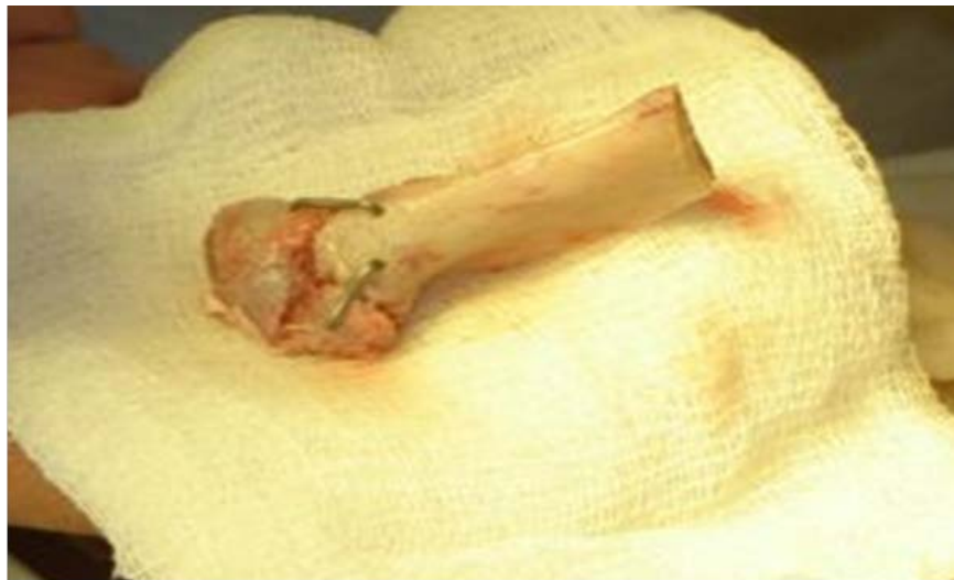
Fig. 2. The patient B, 17 years. The modeling of the replantat of the articular head of the condylar shoot of the temporomandibular joint by brackets made from TiNi alloy

replantat of the articular head from three fragments by means of mini-brackets from TiNi 4-5mm of thermomechanical processing with shape memory (Fig. 2), the articular head of the modeled replantat is put into the articular fossa (the articular disk is kept and is in the fossa), the tendon of the external wing-shaped muscle, with the immobilization of the replantat to a jaw branch with omega-shaped brackets of TiNi is taken in. (Fig. 3)