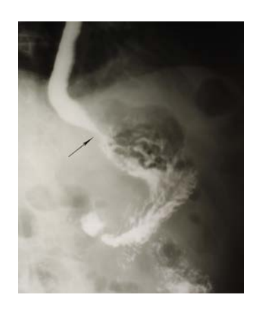
Fig. 3. X-ray picture of the patient P. 18 months after surgery. The arrow indicates a transition zone cardioesophageal