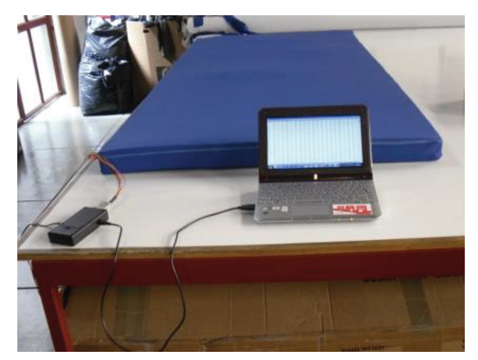
Figure 2: Real scale prototype view

The integration of the finished and validated electroactive textile system is depicted in Figure 2. A fully equipped prototype, assembled and deployed into hospital facilities to run the clinical trial, can be seen in Figure 3.