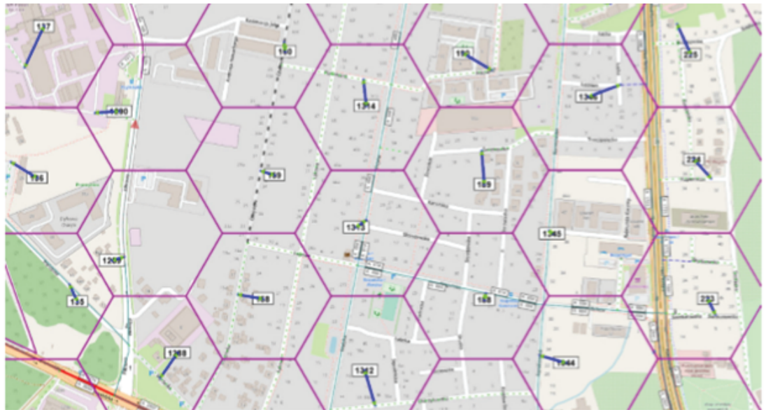
Figure 4: Example of connectors in the hexagonal transport demand model

b) internal trips within one transport zone are significantly minimized, which is one of the biggest problems of classic transport models;