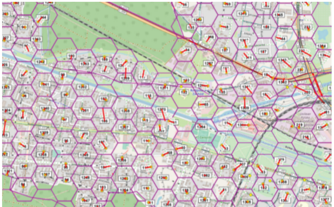
Figure 3: The map of transport demand model within the study area divided into hexagonal zones

D_{c(N_i,N_j)} – the smallest accepted distance between nodes N_i and N_j with the given transport network of the transport system c .