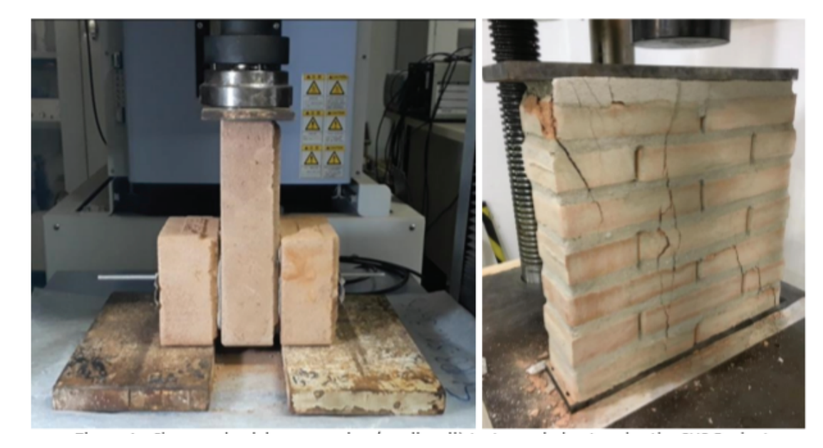
Figure 6: Shear and axial compression (small wall) tests carried out under the SHS Project. Source: [3].