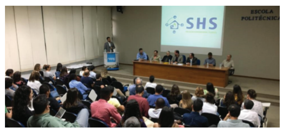
Figure 9: Launch event of the SHS Project and conclusion of the first class of the SHS Course. Source: [3].

Currently, the SHS Project seeks to improve the characteristics of the house model in structural masonry in soil-cement bricks for seismic threats, so it is necessary to advance to the construction of natural scale model in seismic platform. Therefore, sponsorship and cooperation are sought to accomplish this task at the National Laboratory of Civil Engineering, LNEC, in Portugal. Still on the subject of seismic engineering, studies are being conducted to verify the possibility of reducing the effects of soil liquefaction in