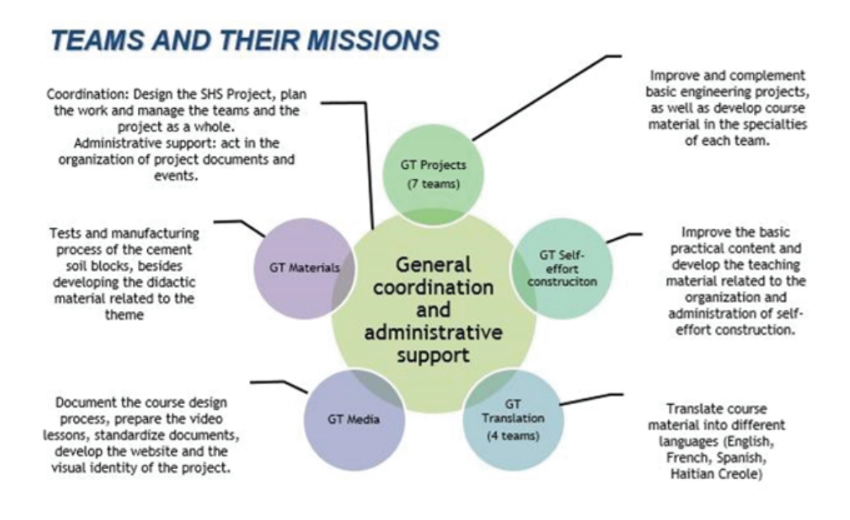
Figure 3: SHS Project teams and their respective missions.

Soil samples were prepared according to the Brazilian standard NBR 6457 (2016). Tests were performed to determine grain size, true grain density and Atterberg limits, following the standards described in the Brazilian standards NBR 6459 (2016), NBR 6458 (2016), NBR 7180 (2016) and NBR 7181 (2016). An empirical test was also performed to verify soil shrinkage during the air drying process (channel test). Water absorption of soil-cement bricks was verified according to NBR 8492 (2012). The compressive strength was verified according to NBR 8492 (2012) and NBR 10836 (2013). NBR 10836 (2013) was used to describe a testing methodology considered more practical to be performed by disaster-affected communities, as it would not be necessary to cut the bricks in half. The compressive strength of the bricks was measured at 7, 14, 21 and 28 days, in order to investigate the possible strength gain over time (figures 5 and 6).