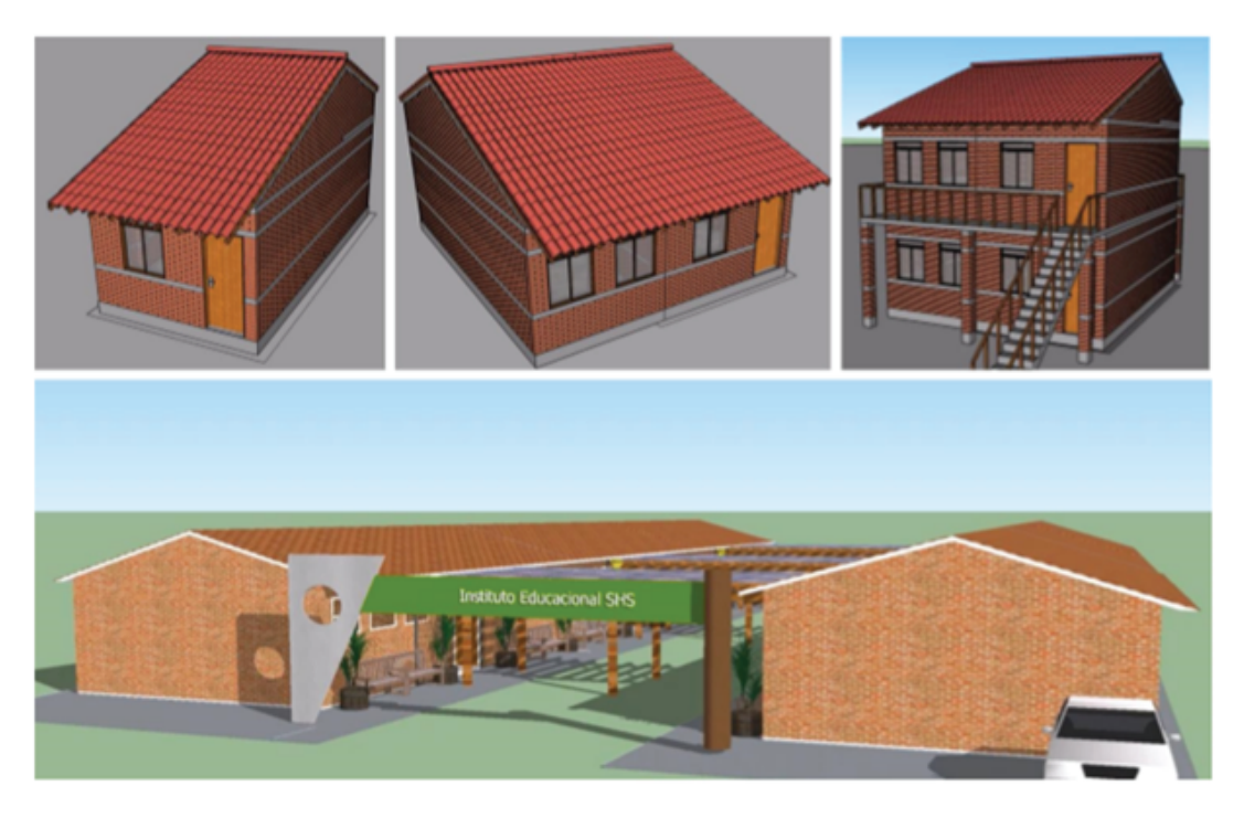
Figure 2: Housing and school models for conventional situations (without considering extreme threats). Source: [3]

considered suitable for the situations in which the project is intended, such as: the use of local soil as construction material; the use of manual presses for the manufacture of bricks, which do not require electricity; the relatively simple and fast manufacturing and construction process that can enhance the employment of the community's own labor force; relatively low environmental impact when compared to conventional building technologies; the process allows the involvement of the population and the incorporation of equipment and skills that can be used as generators of work and income for communities after the reconstruction of the houses; among others.