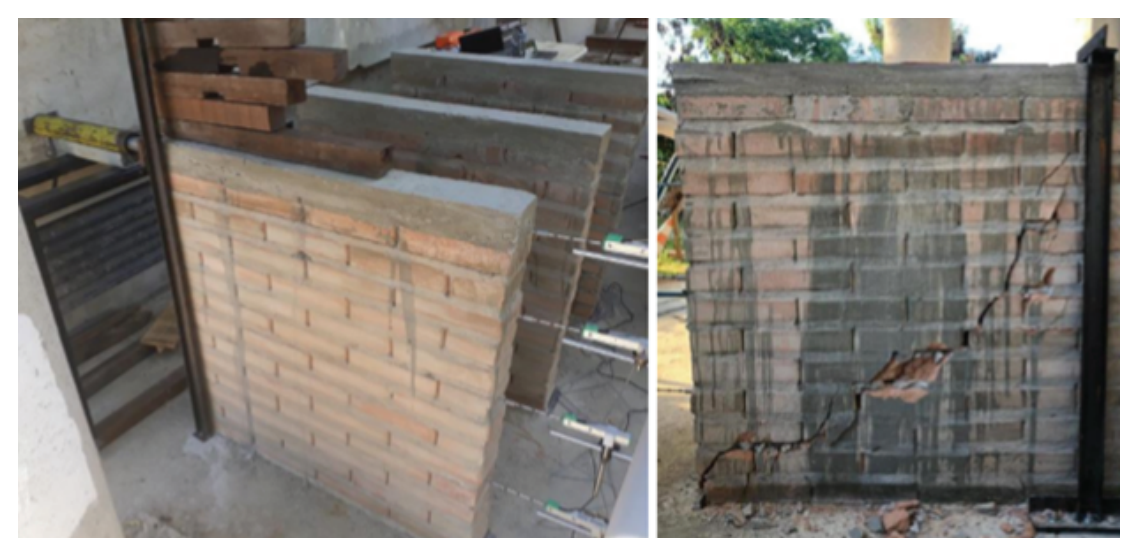
Figure 7: Horizontal load tests (small wall) carried out under the SHS Project.