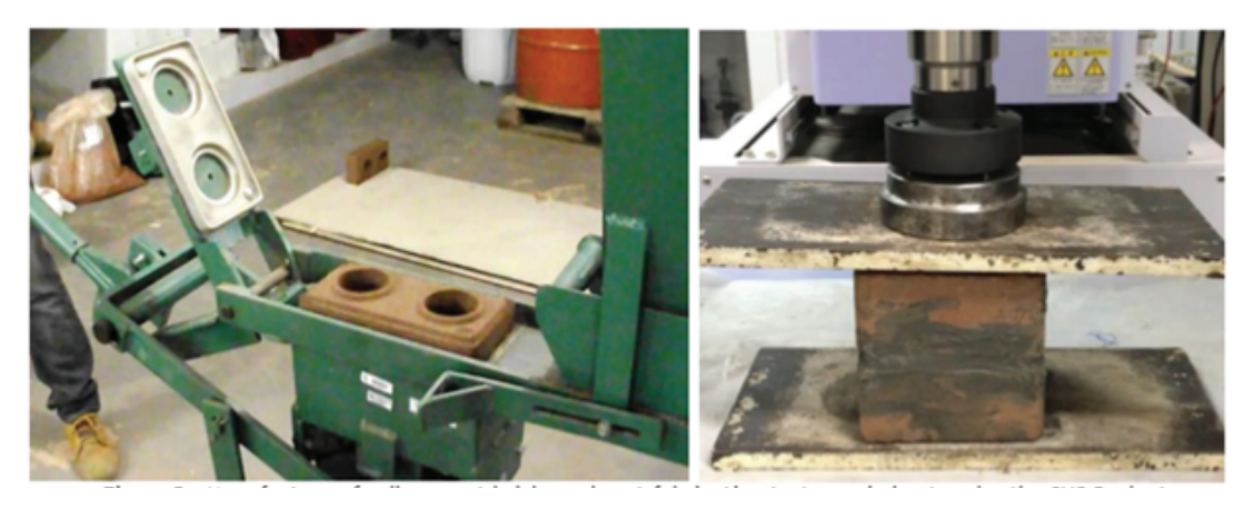
Figure 5: Manufacture of soil-cement bricks and post fabrication tests carried out under the SHS Project.

situations, carried out according to NBR 15421 (2006). Wind calculations were made according to NBR 6123 (1988).