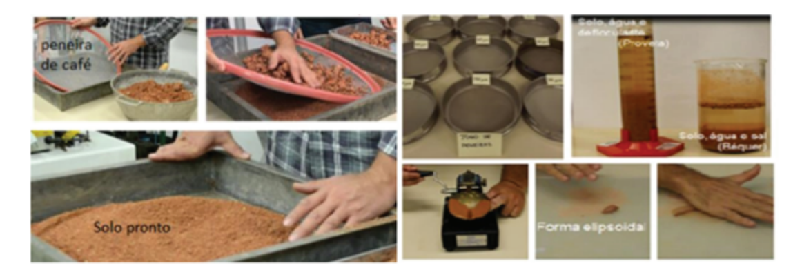
Figure 4: Soil preparation and prefabrication tests carried out under the SHS Project.

situations, carried out according to NBR 15421 (2006). Wind calculations were made according to NBR 6123 (1988).