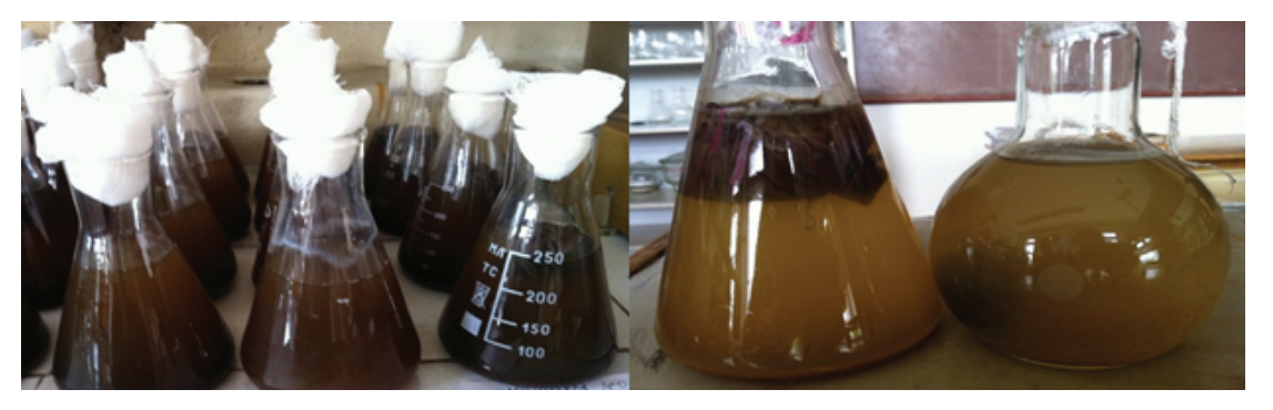
Figure 1: A series of experiments with the immobilised microorganisms.

Tap water with the activated sludge added was used for control.