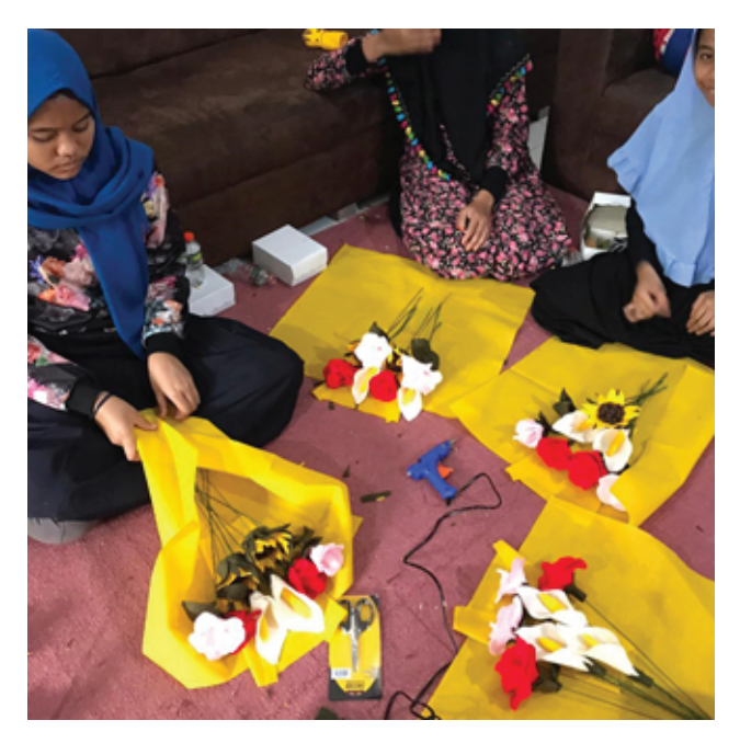
Figure 2: Arranging Flannel Flower Bouquet

were also conducted. At the end of the entrepreneurship training, participants were given time to plan their business to sell the flannel flower bouquet that they made in previous sessions.