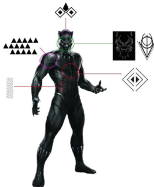
Figure 5: Adinkra and Nsibidi Symbols

pictograms. Nsibidi is widely used by the Nigerian people. In this study, only one Nsibidi symbol was analyzed. The symbol is a triangle symbol found on almost the entire surface of the costume so that it forms a pattern. The triangular pattern in Nsibidi has the meaning of leopard skin or in the Indonesian language leopard skin. As described above, the Black Panther is a superhero who adapts the appearance of a leopard in terms of physical form, fighting style and so on. In the Black Panther costume, leopard skin which in its original form is irregularly shaped, represented by a symbol of the Nsibidi triangle pattern. It aims to strengthen the value of African culture and add aesthetic value.