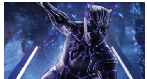
Figure 2: Black Panther Costume

The Black Panther costume is used by T'Challa when he needs it. When he doesn't need a costume, he keeps the costume in the necklace he always wore. All parts