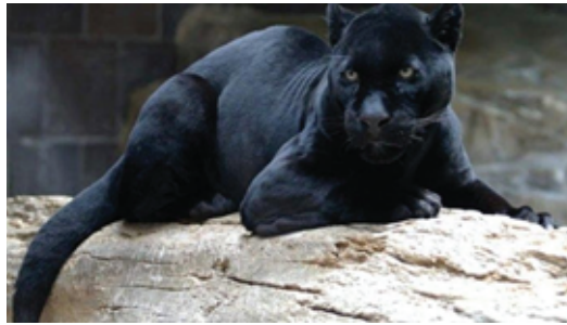
Figure 3: Panthera Pardus Melas / Black Panther

of the costume can be stored on a small necklace because of the nanotechnology developed by Shuri. T'Challa's necklace is shaped like an animal's teeth. In African culture, the necklace has a philosophical meaning that indicates the user's social status. For T'Challa, the necklace marks T'Challa's status as Wakanda leader.