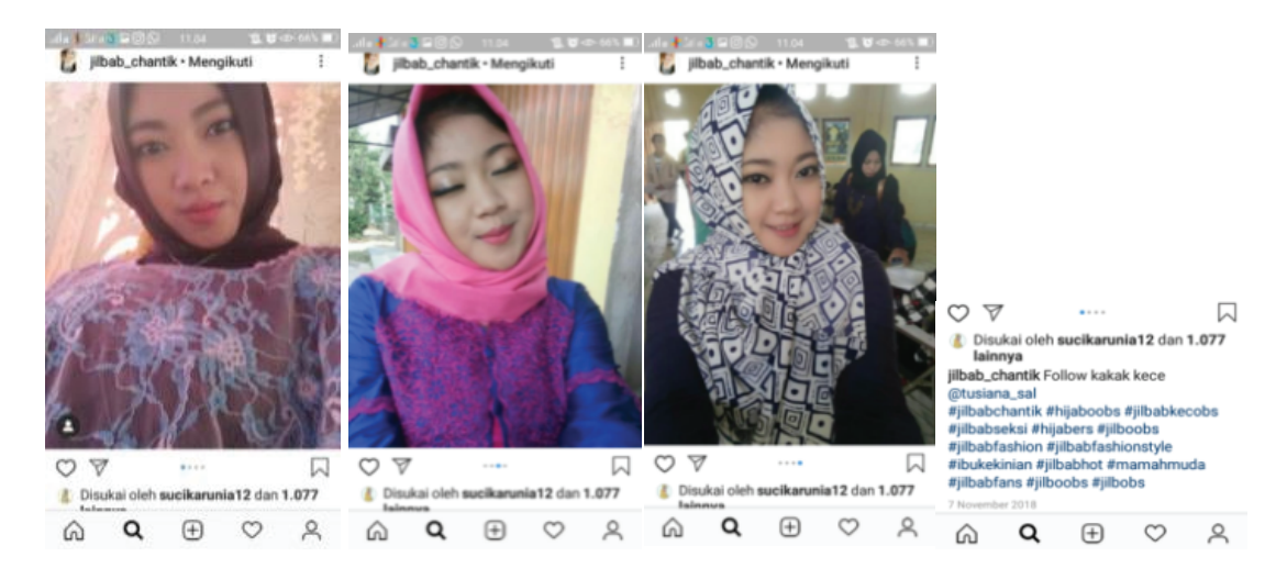
Figure 3: Screen shoot from @jilbab_chantik on July 6, 2019

Three screen shot images (fig.2) above are one person selfie hijab who send several photos to the admin via Direct Message. Hijab selfie posted on November 7, 2018 is the photos which has the most number of likes compared to other photos. This photos got 1,078 likes. The accompanying caption wrote the follow sister kece by mentioning the account @tusiana_sal as the photo owner's identity. The accompanying hashtag is #jilbabchantik #hijaboobs #jilbabkecobs #jilbabseksi #hijabers #jilboobs #jilbabfashion #jilbabfashionstyle #ibukekinian #jilbabhot #mamahmuda #jilbabfans #jilbobs (fig 2d). All of three photos are wearing hijab that varies in color, with shooting angles and expressions that also vary. Instagram as a digital media platform that records posts can change at any time, not fixed. These changes are found in Fig 3(a) which was the result of screen shoot on September 18, 2019. This post received an additional 9 likes became 1,087, but possibility change.