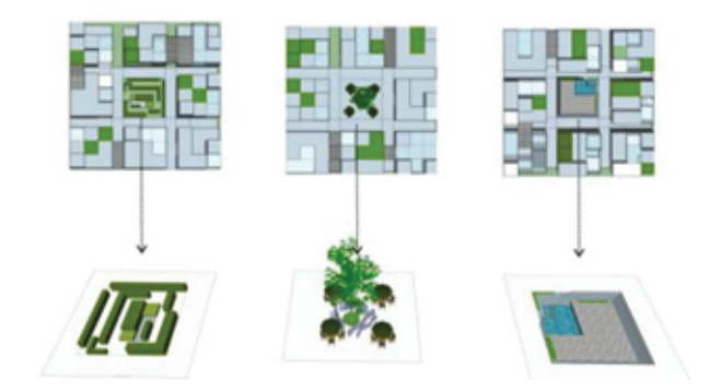
Figure 5: Concept of courtyard

by 8-9 households. The courtyard space is arranged in the middle to serve the daily outdoor activities of the residents around the courtyard. The shared platforms and gardens should be added to meet the daily needs of residents to dry clothes and grow flowers. Moreover, it can enhance the connection between residents and continue the neighborhood culture.