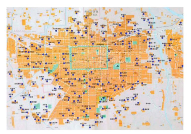
Figure 1: Distribution of villages in Xi'an City

The position of the village in Xi'an City is relatively scattered. Basically, in all directions, and administrative regions, there are a certain number of villages in the city. As Xincheng District, Lianhu District, and Beilin District are located in the central area of Xi'an, the city construction is faster, and the number of villages in the city is small. Most of the villages in the city are concentrated in the urban area from the second ring road to the third ring road.