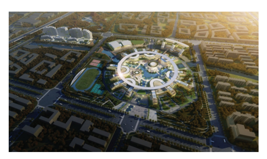
Figure 11: HPP XJTLU Taicang Campus design XJTLU, Taicang 2018 [13].

growth and long term economic stability and flexibility is another key point in both fast growing and expanding nations. The business relationship structure of architects, client local governmental and end user being the university itself is similar. The size of the developments are comparable between the Sustainability Campus design in the UAE, RIT-D in Dubai and the Taicang development for XJTLU in China. In both cases the governmental entities are selected top architectural firms.