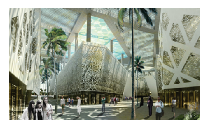
Figure 4: Polis Front Architecture, RIT-Dubai, UAE, interior, 2013.