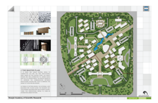
Figure 8: GHD master planning [[6]].

The design was approved by HH Sheikh Sultan Al Qassimi of Sharjah in 2008. The translation of the project into practice was suspended due to the economic correction of 2008/09.