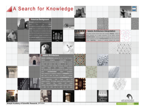
Figure 7: GHD concept board [[5]].