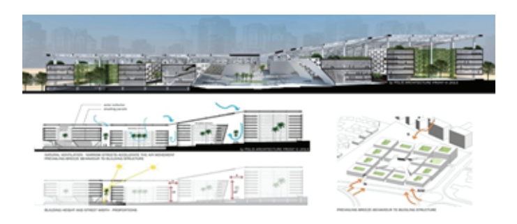
Figure 3: Polis Front Architecture, RIT-Dubai, UAE, sections, 2013.