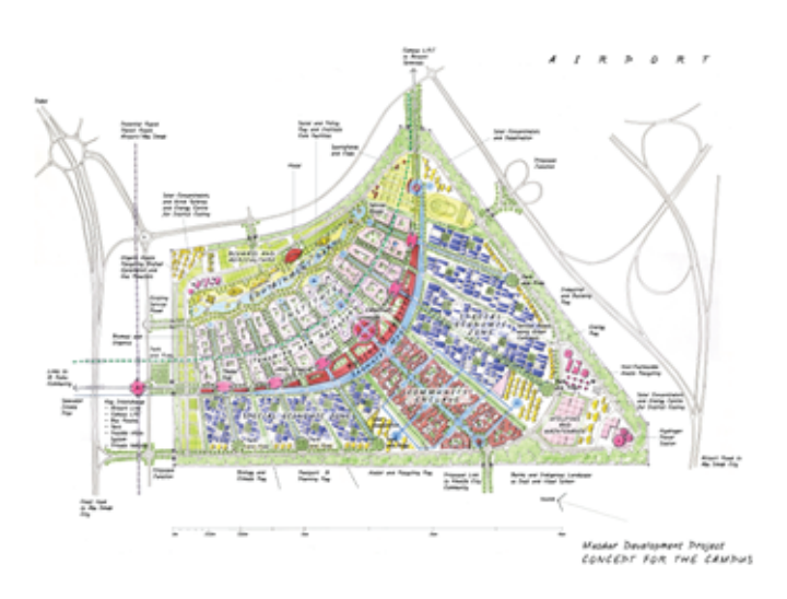
Figure 6: ATKINS, Masdar urban planning proposal [[4]].