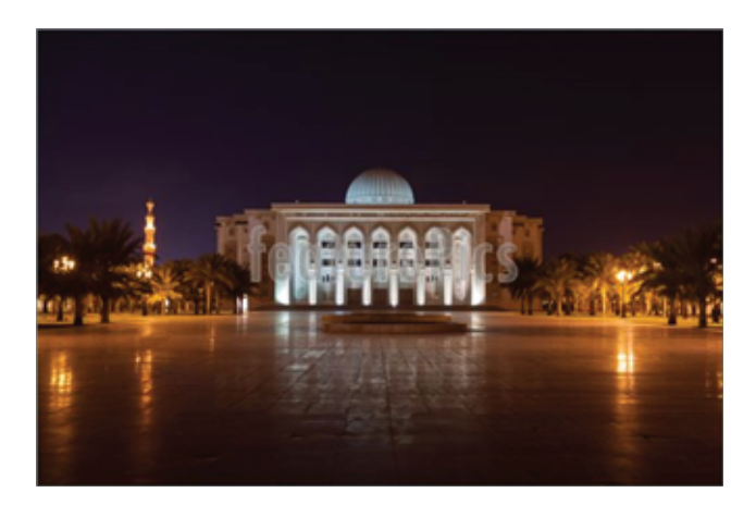
Figure 1: American University of Sharjah.

universities have architecturally set on a classical style of architecture to instil and create history.