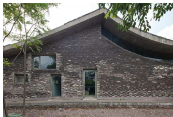
Figure 6: Five Scattered house, the experiment of the tile wall technique, Ningbo, 2004 [14].

accepted in a large, public, government-invested building project. Wang Shu was once accused of insisting on showing backward things in Ningbo by displaying the ancient tile material in the new urban area. Wang Shu retorted that the first function of the museum is to collect time. This building technique will make the Ningbo History Museum project of 2008 the most exquisite museums in collecting time. After the success of the Ningbo History Museum, Wang Shu was commended his keen way of supporting architectural heritage where globalization has stripped cities of their special attributes.