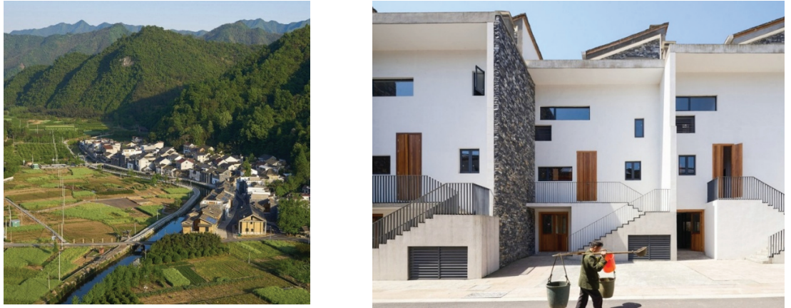
Figure 8: Fuyang, Wen Cun, Fuyang, 2015 [19].