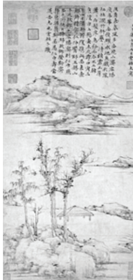
Figure 2: Rong Xi Zhai Painting [10].

it has been an indispensable part of the soul of Chinese cities. He summarizes new feelings and records them every time he walks in the garden. One day, a small garden named Cang Lang Pavilion in Suzhou attracted his eyes. In the garden there was a small single storey building almost completely hidden behind a grove of dense bamboos. “Cui Ling Long” which features three houses conjoined diagonally by their corners. Noticing that people will forget the architecture while moving through the trembling bamboo shadow in the breeze, Wang Shu came up with a complete set of architectural models. In the Spring of 2004, he designed a three storey building with a rectangular plan in one of the five scattered houses. Each floor is three to four meters high, and its section just looks like the plan of “Cui Ling Long”, which twist and turn two times. This small building was named as “Tai Hu Fang” at last. Many years later, while planning the Xiangshan campus for the China Academy of Art, Wang used this experimental model to develop six more variation of this typology and located them in the campus [4](Wang, 2016).