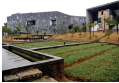
Figure 1: Farmland Inside Xiangshan Campus [8].