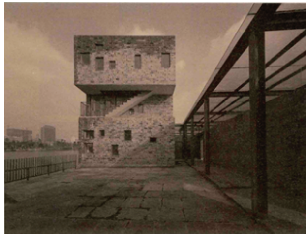
Figure 4: Tai Hu Fang, Ningbo, 2004 [4].

Using this kind of construction method for the first time, he and his colleagues tried many different ratios of clay and earth material. Unfortunately, due to weather changes, the two-wall sculpture collapsed many times.