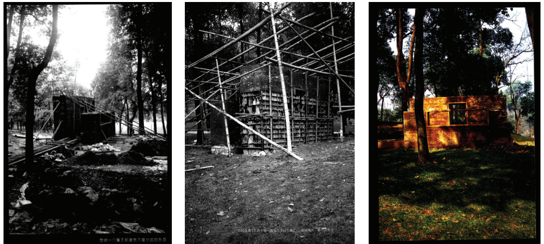
Figure 5: Construction & Experiment Process of Rammed earth wall, West Lake International Sculpture Invitation Exhibition, 2000 [12].

under the leadership of Wang Shu, the amateur architect studio experimented with these kinds of technique. They learned from craftsman, then taught the workers to build the clay tile wall on the construction site [12](Wang, 2002). At the Ningbo Museum, this experiment first became