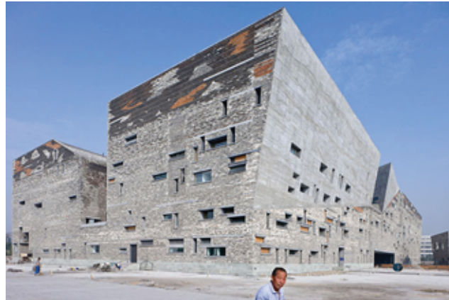
Figure 7: Ningbo History Museum, 2009 [17].