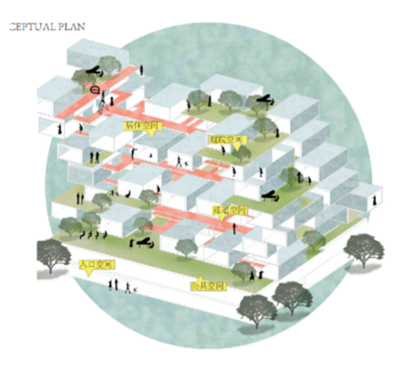
Figure 2: Intention figure (source of the picture: drawn by the author).

In this design scheme, the outdoor space order is mainly divided into four spaces: "public-semi-public-semi-private-private" to improve the level of community outdoor space, and meet the needs of residents' activities, communication, and privacy. Mean-while, in the "private" area adjacent to the indoor space of residents, the residents are encouraged to participate in the design and reconstruction according to the individual needs, extend the indoor area to the outdoor area, increase the identity of the residents, and blur the boundaries of indoor and outdoor areas to some extent.