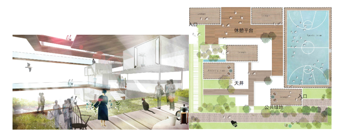
Figure 4: Intention figure.