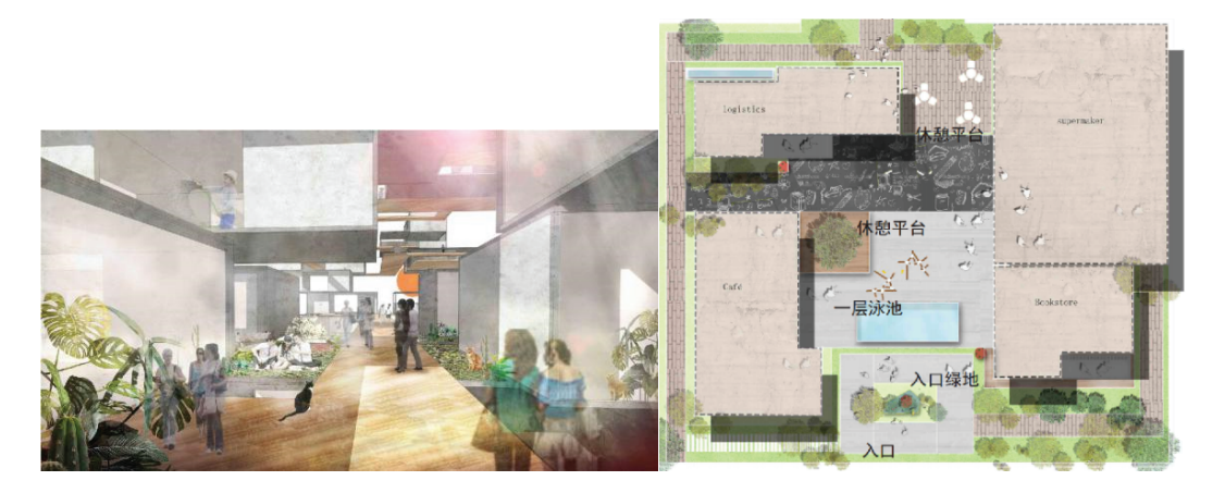
Figure 3: Intention figure.

The design of whole intention plan focuses on the shaping of community outdoor space. Therefore, the indoor space of the building is simplified as a regular cuboid, which is enclosed as the entity of outdoor space. The streamline entrance is on the first floor. The whole mode is "entrance space-traffic-the entire community public space (covering the entire community, such as basketball courts, supermarkets, bookstores, etc.)-Trafficlocal area public space (covering surrounding households, such as public vegetable fields, swimming pools, etc.)-Traffic-public space at the door of the household-(covering independent households, different function settings can be made according to the needs of residents).