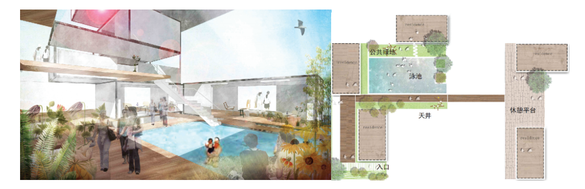
Figure 5: Intention figure (source of the picture: drawn by the author).