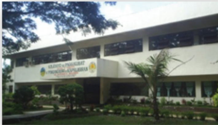
Figure 2: College of Forestry and Environmental Management Building.