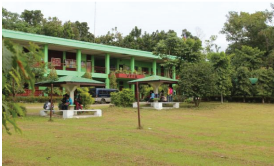
Figure 5: Provincial Technical Institute of Agriculture Building.

the highest carbon footprint emission is usually recorded during the months of June, July, August and September while the lowest was consistently recorded during the month of January. However, the significant variation can be explained by the varying energy consumption of the buildings which is influence by the number of occupants and number of electrical fixtures and equipment used for cooling and ventilation inside the buildings for each month and year. The temperature during the month of January is usually very low as compared to any other months which also influenced the lower energy consumption of the buildings. Based on the ANOVA Table 4a, evidently, the results show that there is indeed an annual increase of Carbon Footprint in the campus. Figure 7 below is the Annual Estimated Marginal Means of Carbon Footprint from 2011