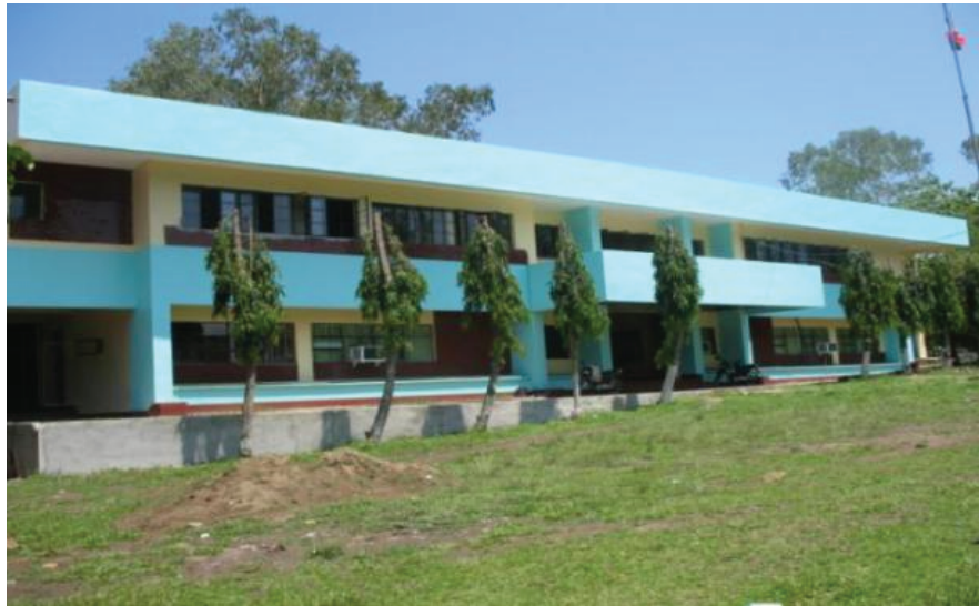
Figure 4: Department of Social Sciences Building.