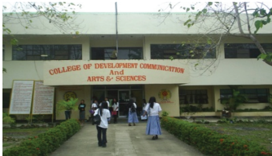
Figure 3: College of Development Communication and Arts and Science Building.