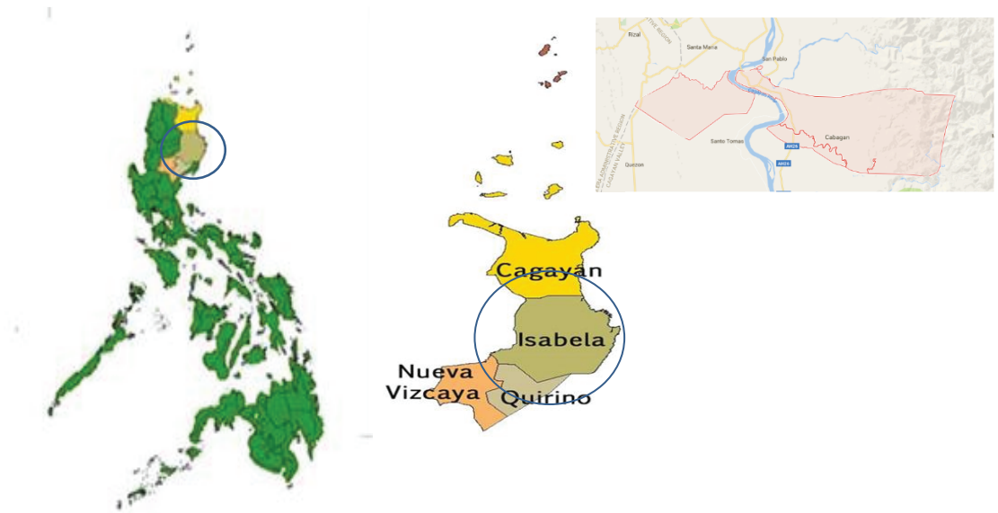
Figure 1: Map of Cabagan Isabela showing the location of ISU Cabagan.