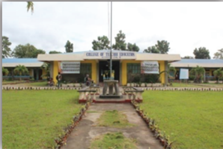
Figure 6: Teachers College Education Building.