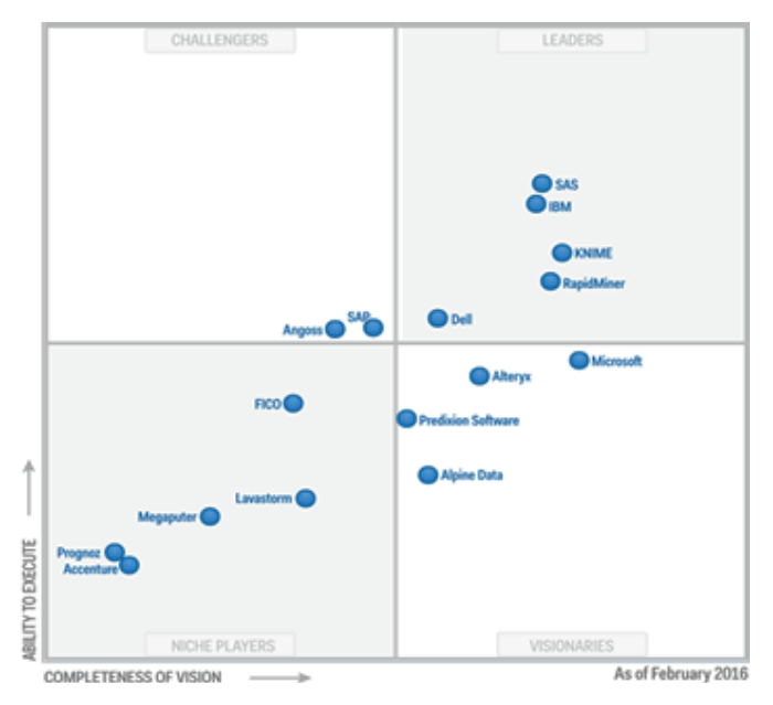
Picture 2: Top companies-developers of advanced analytics platforms.

Through a variety of analytical tools used in a new generation of High-Performance SAS Analytics, computation of any indicators, modelling, analysis and decision-making process became much faster, more accurate and, as a result, more effective. More and more companies use SAS products for performing analytical procedures. In Russia all of the 10 largest banks are among SAS clients, many other real companies of finance sector and others, for example RZD, MTS, MGTS.