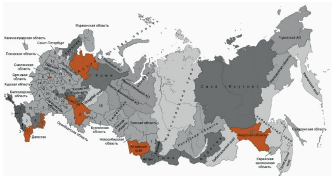
Figure 1: Top 10 subjects by the number of publications of an extremist nature.