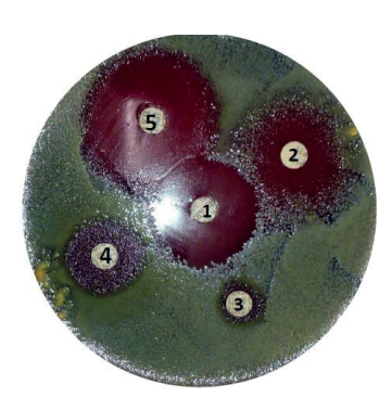
Figure 6: A.viridans antibiotic susceptibility.