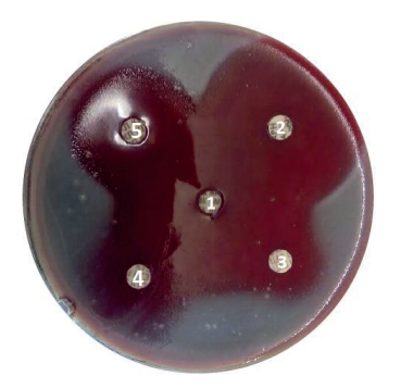
Figure 7: N.perflava antibiotic susceptibility.