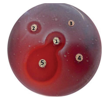
Figure 3: S.pyogenes antibiotic susceptibility.