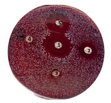
Figure 4: G.haemolysans antibiotic susceptibility.