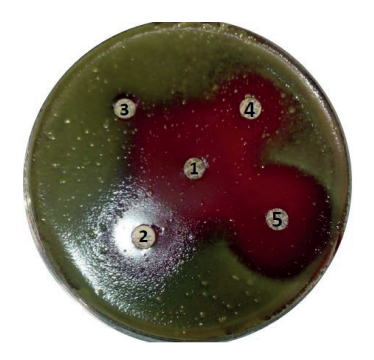
Figure 5: S.pneumoniae antibiotic susceptibility.

Symbols: 1. amoksiklav; 2. azithromycin; 3. ceftazidime; 4. co-trimoxazole; 5. clindamycin.