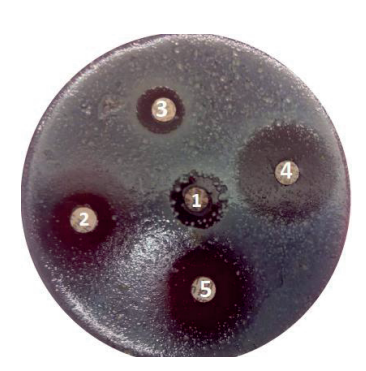
Figure 2: S.aureus hemolytic strain antibiotic susceptibility.